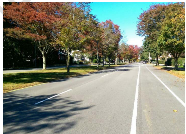
Blue Hills Parkway, Milton. (See Appendix K for photo information.)

There are two connecting parkways partially within the Blue Hills Complex; the Blue Hills Parkway and the Furnace Brook Parkway. Both are associated with the Blue Hills Reservation. Within the Complex, the Blue Hills Parkway extends approximately 1.5 miles from Unquity Road, Milton, northward to the Neponset River. An additional 0.04 miles of parkway is located north of the Neponset River, outside the Blue Hills Complex and within the City of Boston. The Furnace Brook Parkway extends approximately 3.92 miles from Wampatuck Road, at the boundary of the Blue Hills Reservation, to Quincy Shore Drive, Quincy. Only 0.44 miles of the Parkway are within the Blue Hills Complex, which ends at the Southeast Expressway (I-93). Both parkways are historic, and include significant cultural resources. (Table 1.3.1.)