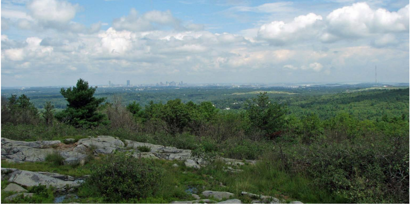
Boston, as viewed from the summit of Buck Hill, Blue Hills Reservation. (See Appendix K for photo information.)