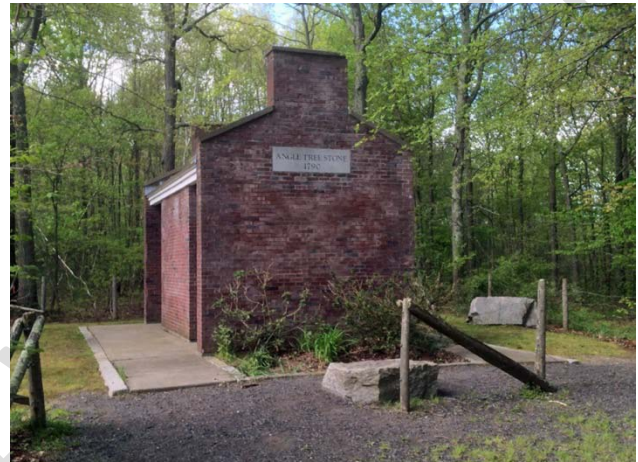
Building at Angle Tree Monument Reservation; spring 2016. (See Appendix K for photo information.)

Angle Tree Monument was placed on the National Register of Historic Places in 1976. In 1981 a brick building was constructed to house and protect the monument. This building is located partially on the Reservation and partially on private land in Plainville. In 2001, the building was cleaned and restored, and the site improved.