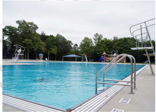
Manning Pool, Brockton. (See Appendix K for photo information.)

between the Massachusetts Department of Public Health (DPH) and the DCR specifies the steps that both parties will take “to facilitate compliance with 105 CMR 435.00: Minimum Standards for Swimming Pools ” at all DCR-owned pools, including those not operated by the DCR. The DCR and DPH provide two days of training to municipal pool operators; this consists of one day of DPH inspection training and one day of pool administration and management training. The DCR helps municipalities correct deficiencies identified during DPH inspections by providing Park Support Operations (PSO) personnel to perform corrective measures. The DCR also provides a separate one-day course in pool management.