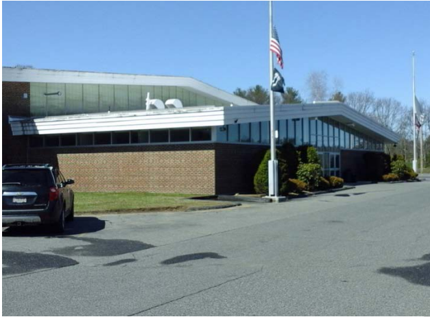
Pirelli Rink, Franklin. (See Appendix K for photo information.)