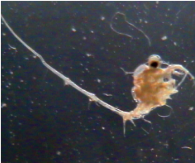
Minnesota Department of Natural Resources.

This non-native organism threatens Quabbin fishing in two ways: