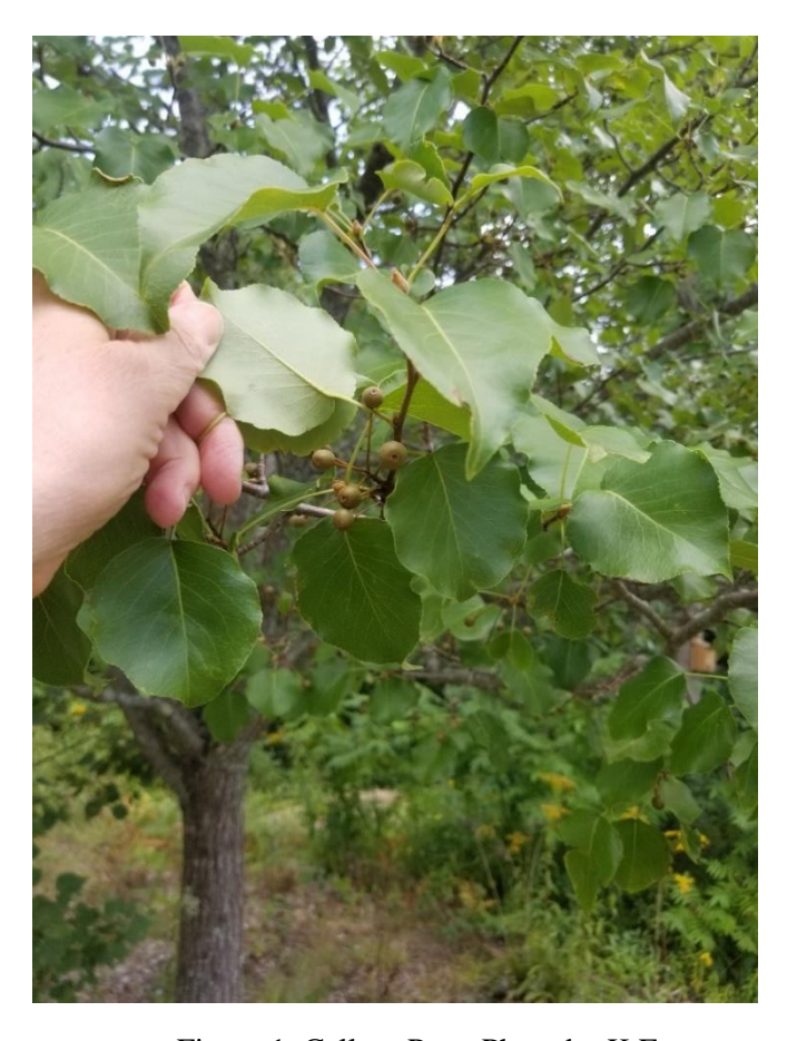
Figure 1. Callery Pear.

Callery Pear is a small, deciduous tree native to eastern Asia. It was brought to the United States in the early 1900s as a species resistant to fire blight that was affecting pear trees across America. Many cultivars have been developed from it; Bradford Pear is one of the best-known cultivars, but there are several. The tree blooms prolifically in the spring with white blossoms before the leaves emerge. The leaves are glossy green all summer and, depending on the variety, turn a glowing burgundy or yellow in the fall. The trees cannot self-pollinate, but if there is more than one cultivar in an area, they will produce copious small, hard, green fruit. It is well known for having nasty smelling flowers, that are variously described as rotting fish, perfume gone wrong, or dirty baby diapers.