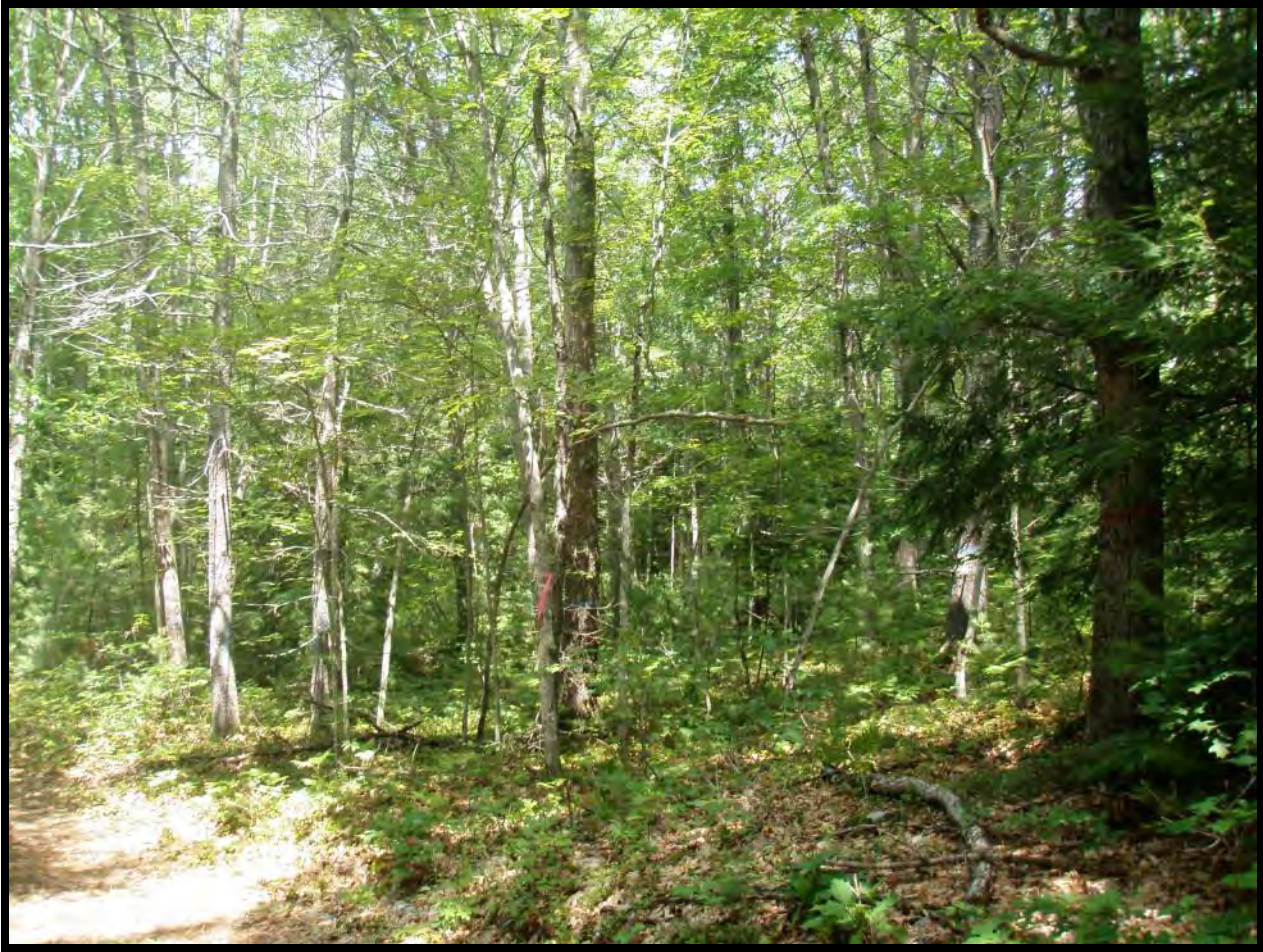
Figure 2. Pre-Harvest photograph from marked photo point 1 taken 7/2/15