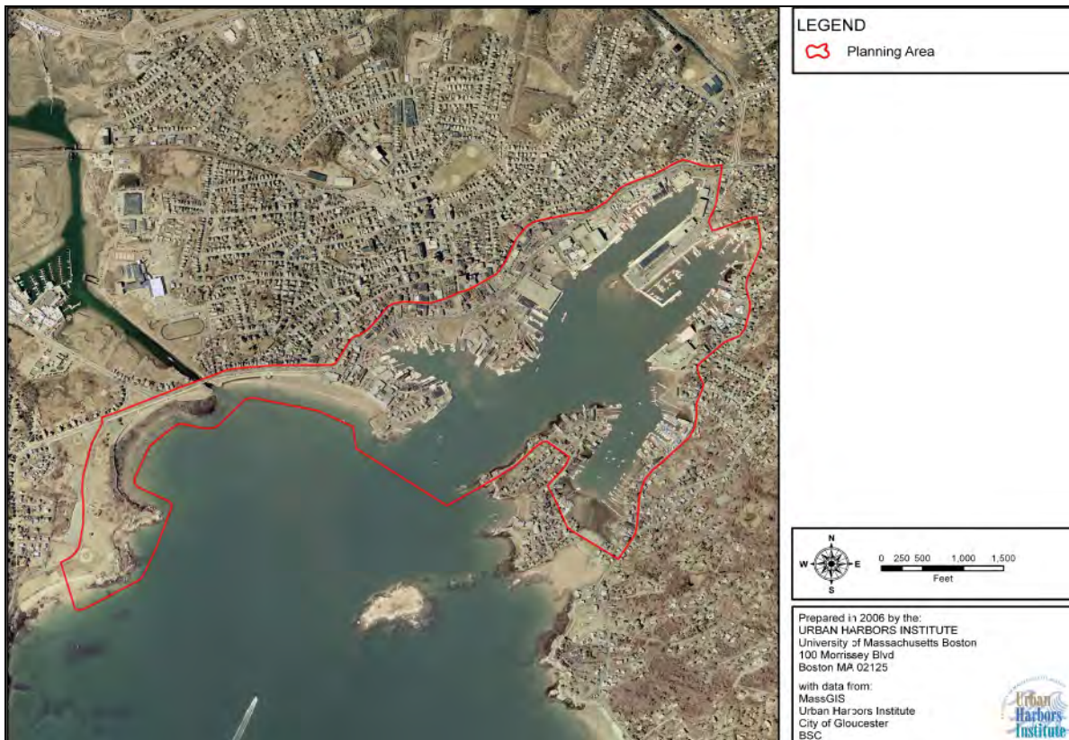
Figure 1. Gloucester Harbor Planning Area

The 1999 Gloucester Harbor Plan was primarily focused on infrastructure improvements for both maritime and visitor-oriented industries along the waterfront as a means of recharging the harbor economy. The 2009 renewal continues to support traditional port improvements while also seeking to provide expanded opportunities for redevelopment within the Harbor Planning Area. The 2009 Plan identifies a number of key strategies to maintain support for the important commercial fishing industry in the city, and also encourages improved opportunity for economic development on the harbor. These strategies aim to streamline regulatory review, stimulate investment, and improve economic conditions along the waterfront.