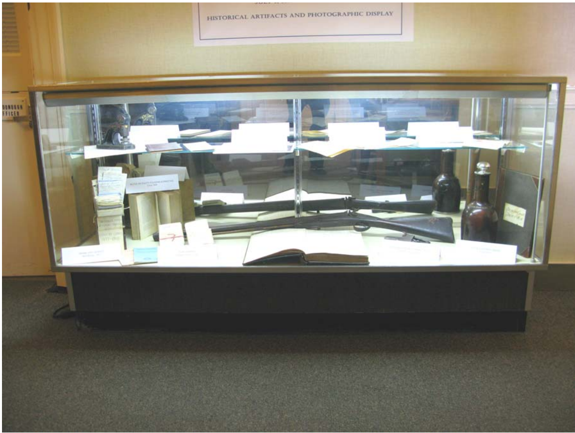
Artifacts and Pictures from Barnstable Superior Courthouse