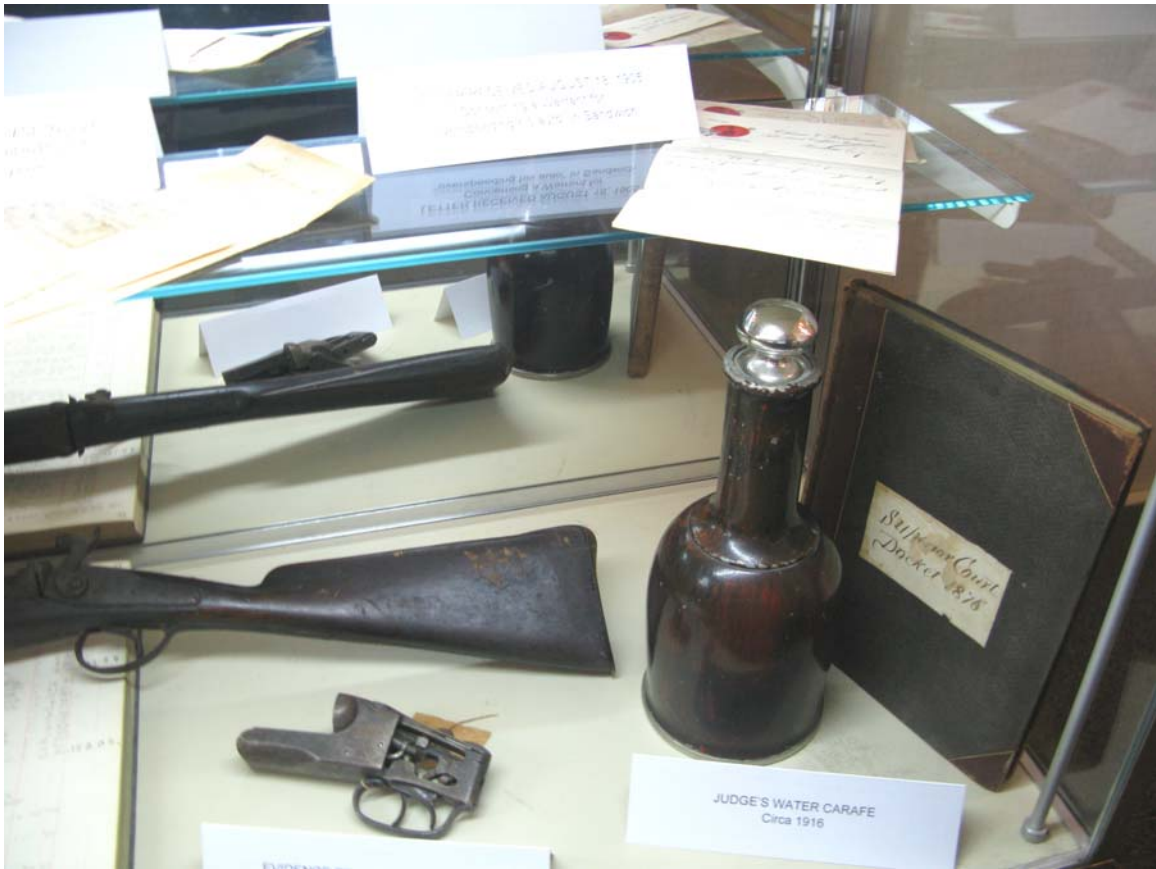
Judge's Water Carafe and Superior Court Docket Book 1878