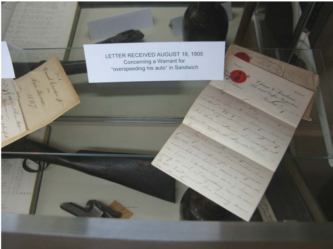
Letter concerning a warrant for speeding in Sandwich