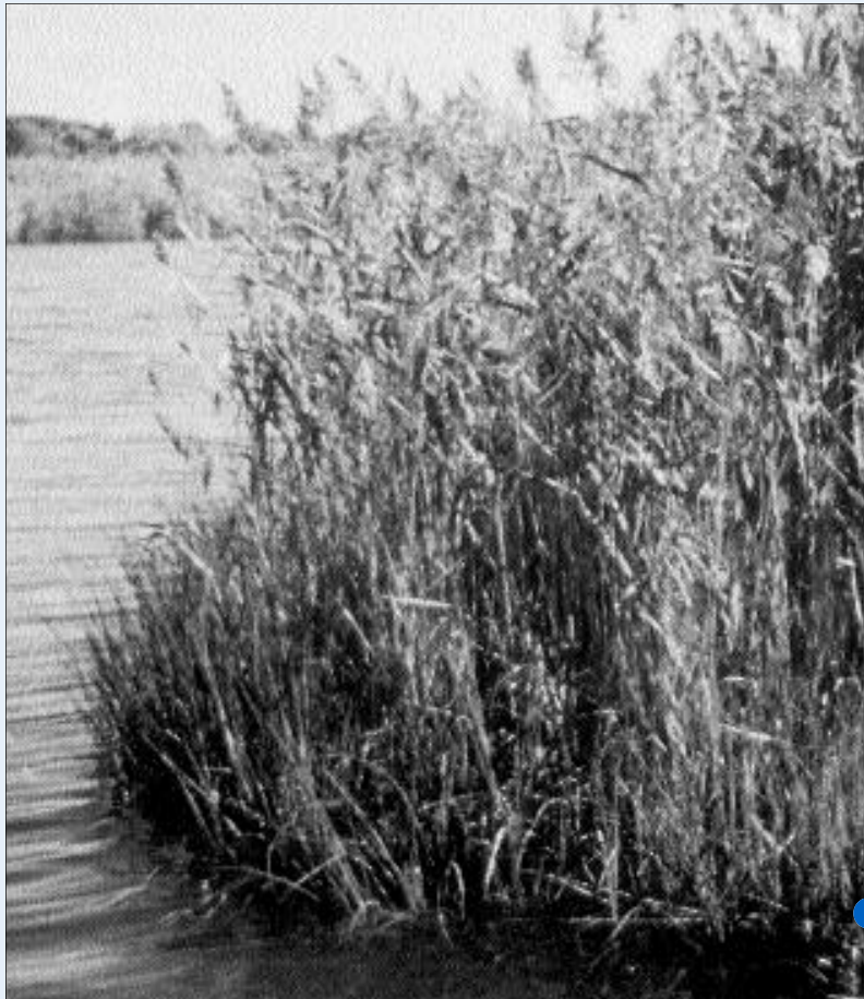
A COMMON SALT MARSH INVADER, PHRAGMITES AUSTRALIS OR COMMON REED.

Outdoor water gardens are growing in popularity across Massachusetts as a centerpiece of residential landscapes. As with home aquariums, plants and fish used in water gardens are often selected because they grow well in stressful environments and require minimal care. Some of the most problematic aquatic invasive species in Massachusetts, such as purple loosestrife ( Lythrum salicaria ), can still be purchased in area nurseries. Because water gardens are usually outdoors and directly exposed to natural