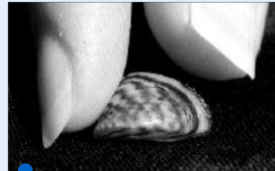
THOUGH SMALL IN SIZE, CONTROL OF THE EUROPEAN ZEBRA MUSSEL SHOWN HERE COSTS THE U.S. HUNDREDS OF MILLIONS OF DOLLARS ANNUALLY.