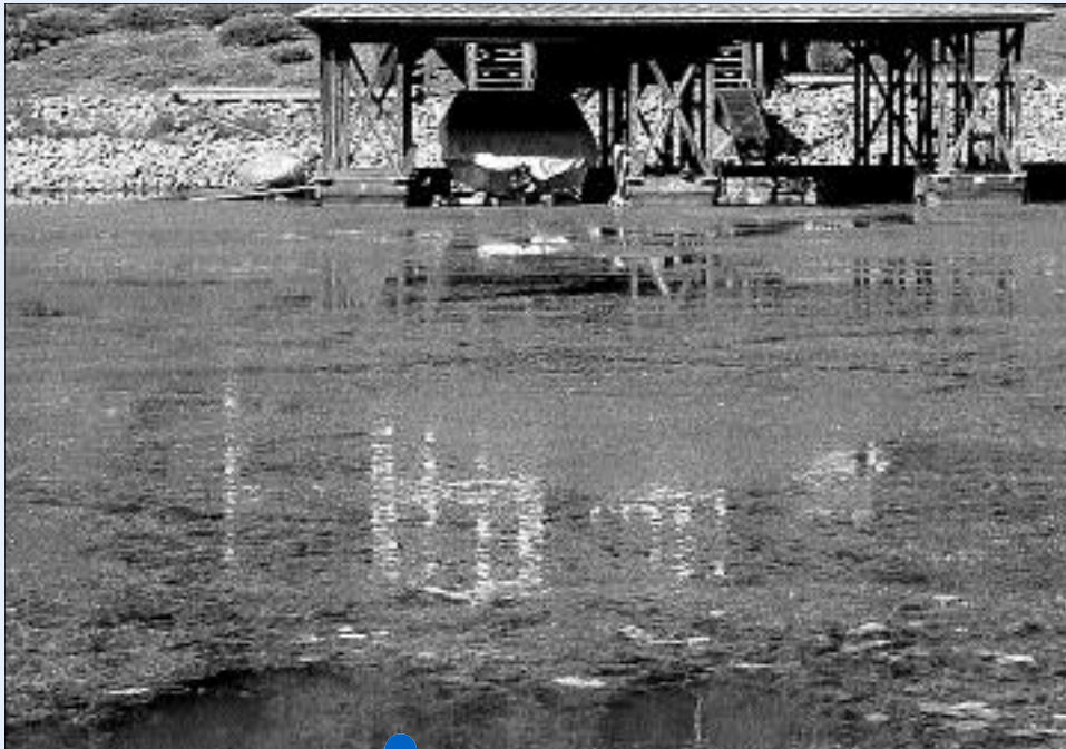
HYDRILLA OVERTAKES A FLORIDA LAKE.