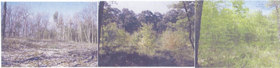
A 0.5 acre patch cut at the DCR Quabbin Reservoir in 1996 (left), 2001 (middle), and 2008 (right).

All harvesting activities on EEA lands are certified by the independent Forest Stewardship Council (FSC) as sustainable forest management. FSC sets high standards that ensure forestry is practiced in an environmentally responsible, socially beneficial and economically viable way. FSC standards are endorsed by environmental organizations such as Greenpeace, National Wildlife Federation, The Nature Conservancy, Sierra Club, and World Wildlife Fund. FSC is also the only certification system used in the LEED Green Buildings program. To learn more about green certification of EEA lands, visit http://www.mass.gov/envir/forest/pdf/forestgreencertificationhandout.pdf .