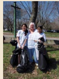
ParkServe Day, DCR