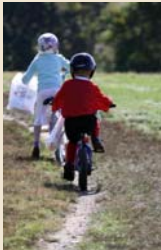
Young mountain bikers, GB-NEMBA