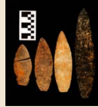
Pre-contact archaeological finds, DCR