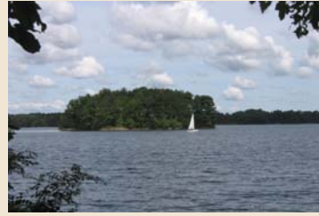
Spot Pond

To protect, promote and enhance our common wealth of natural, cultural and recreational resources.