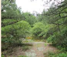
Ridgetop Pitch Pine Scrub Oak Community, Paul Jahrlige