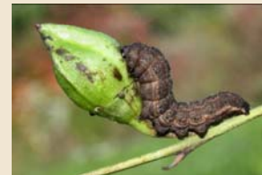
Orange swallow moth