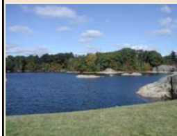
Fells Reservoir, MWRA