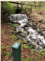
Virginia Wood historic trail, DCR