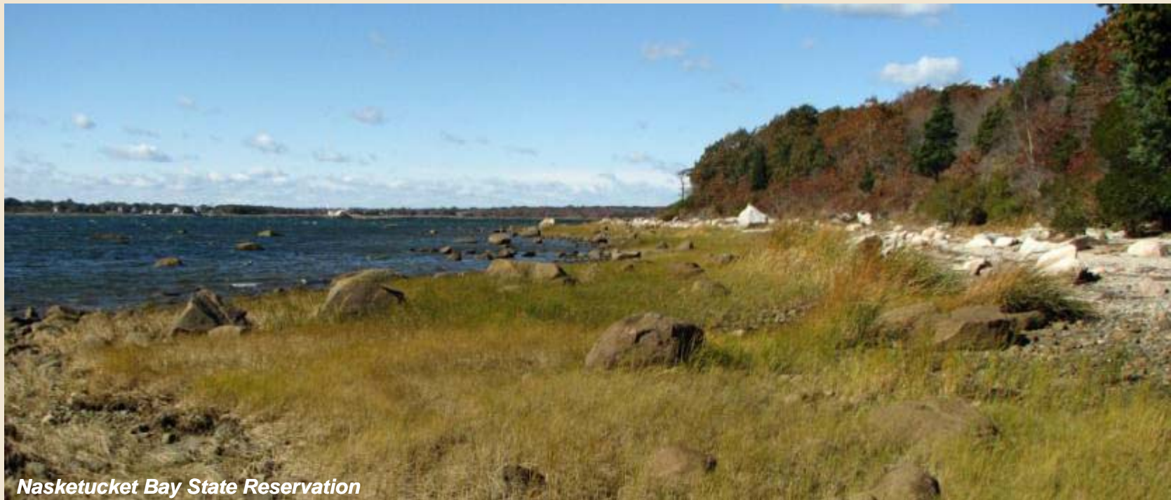
Nasketucket Bay State Reservation

Provide coastal access while actively managing the built environment for recreation and the natural environment for conservation.