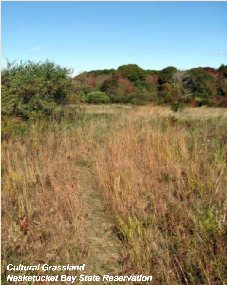
Cultural Grassland Nasketucket Bay State Reservation

Goal 5: Enhance conservation by acquiring additional natural resources information and by actively managing rare species, uncommon natural communities, and populations of invasive plants.