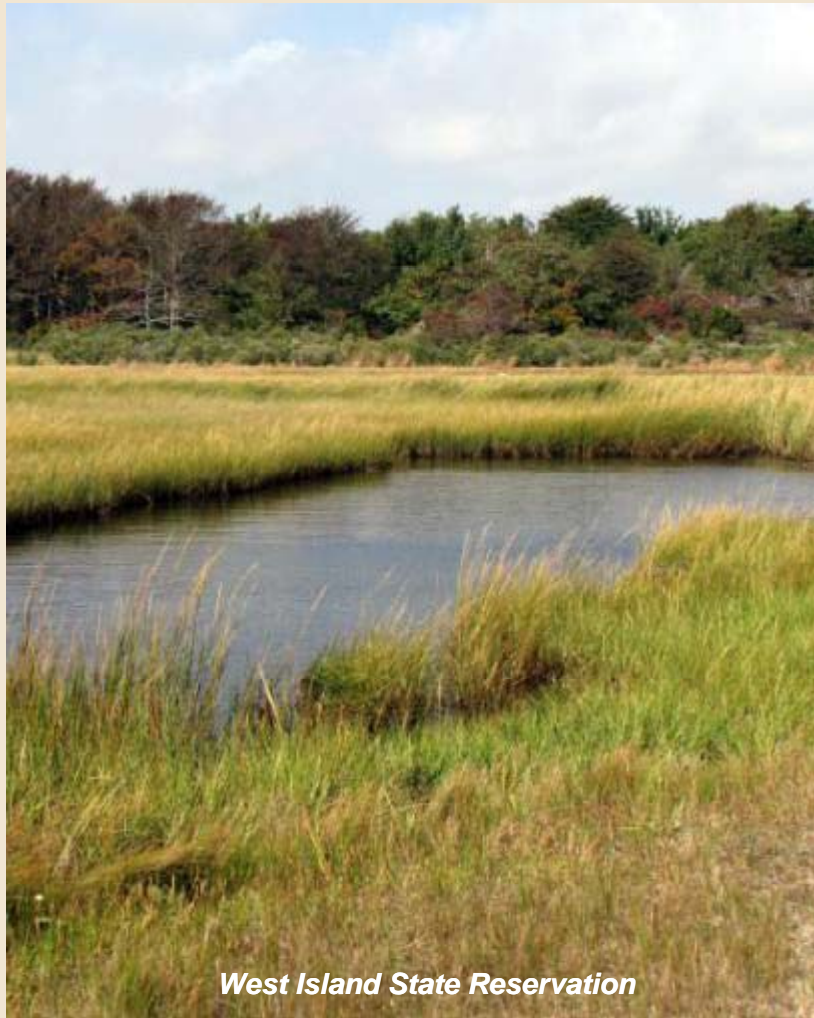
West Island State Reservation