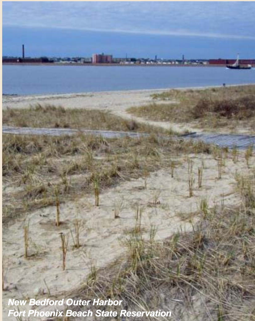
New Bedford Outer Harbor Fort Phoenix Beach State Reservation