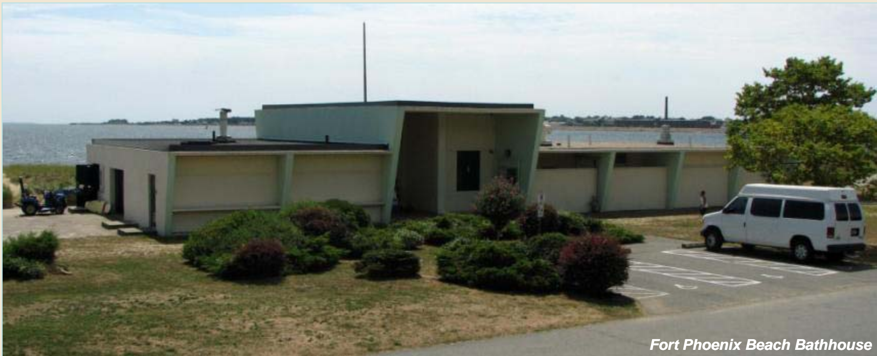
Fort Phoenix Beach Bathhouse