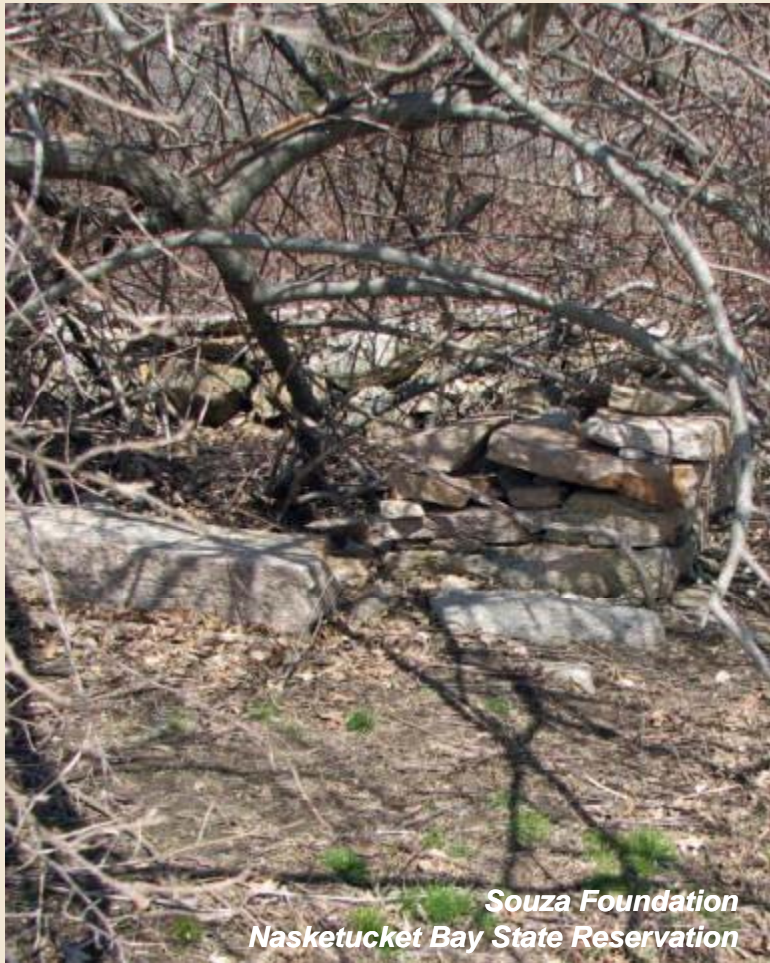
Souza Foundation Nasketucket Bay State Reservation

Goal 4: Preserve and protect existing cultural resources and expand the level of public understanding of the cultural history of each reservation and the surrounding region.