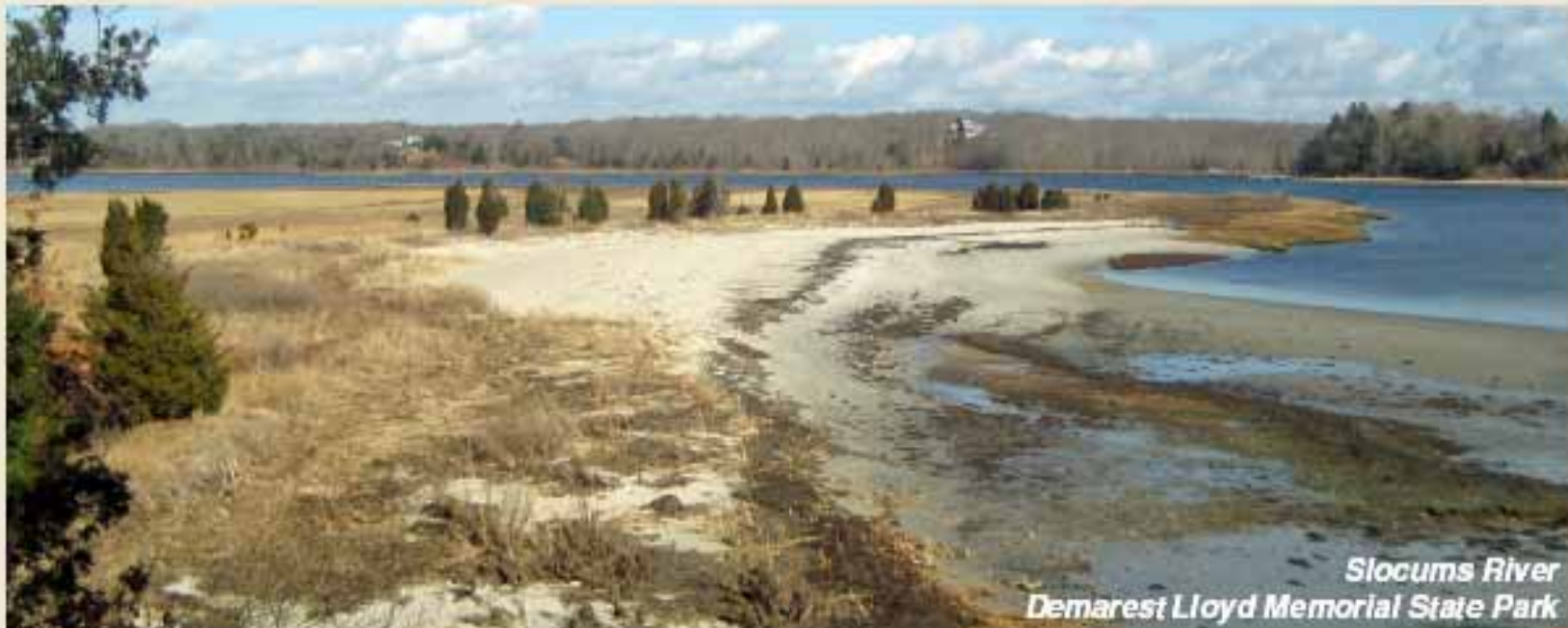
Slocums River Demarest Lloyd Memorial State Park

Achieve a sustainable balance between the conservation of important coastal resources in a dynamic ecosystem, with the provision of recreational opportunities for all