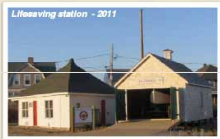
Lifesaving station - 2011

Goal 4: Promote public awareness and understanding of natural and cultural resources, to increase support of the Department of Conservation and Recreation's stewardship strategies