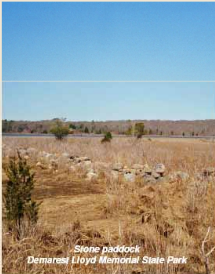
Stone paddock Demarest Lloyd Memorial State Park

“shall include guidelines for the operation and land stewardship of...reservations, parks and forests”