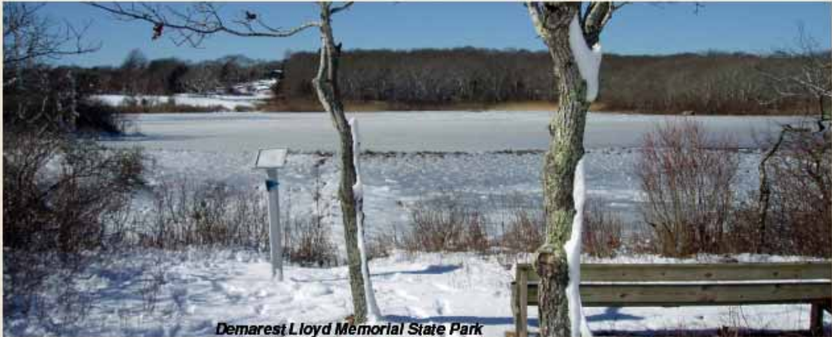
Demarest Lloyd Memorial State Park

To protect, promote and enhance our common wealth of natural, cultural and recreational resources