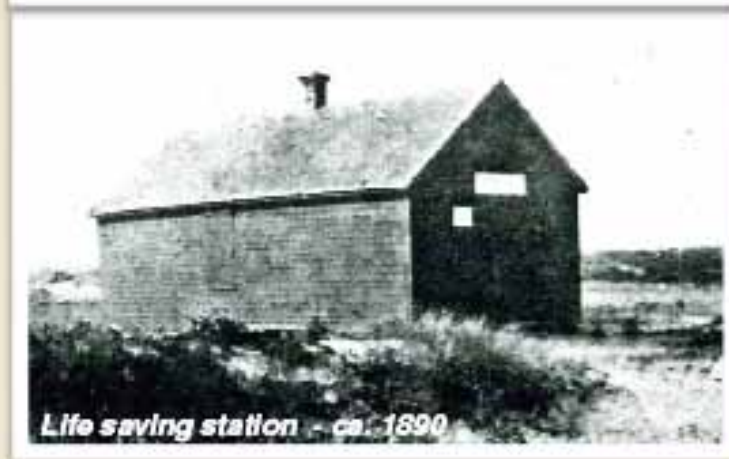
Life saving station - ca. 1890