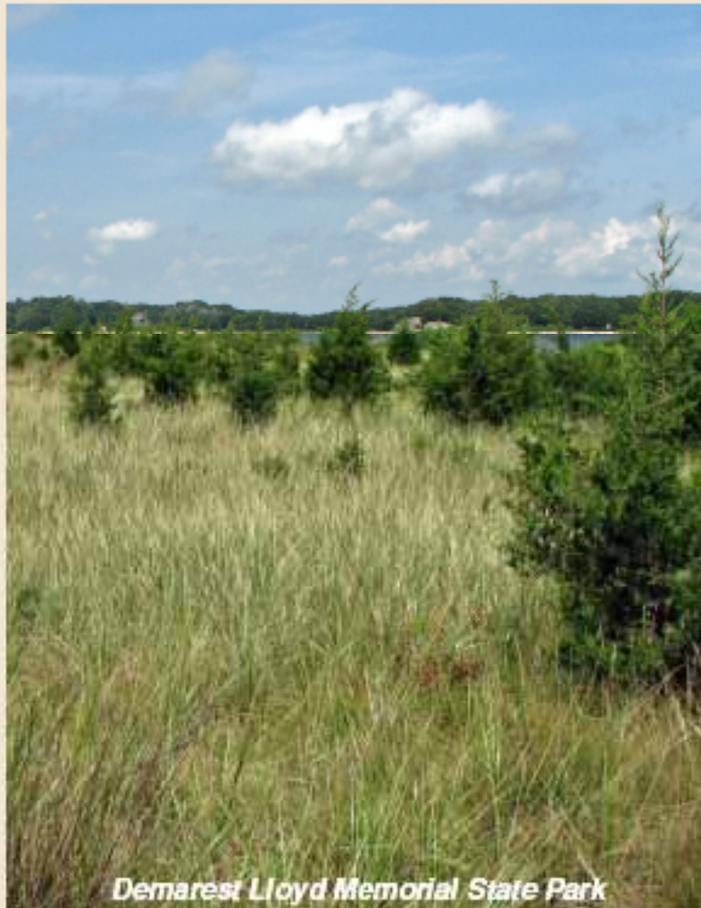
Demarest Lloyd Memorial State Park