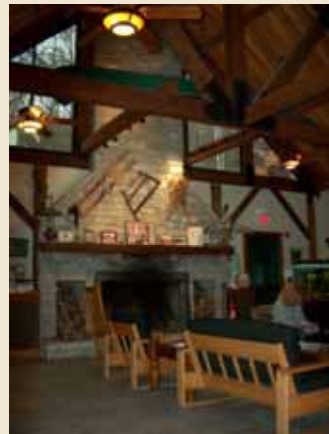
Breakheart Reservation Saugus, MA