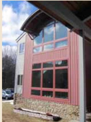
Doyle Conservation Center Leominster, MA