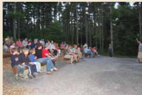
Myles Standish State Forest