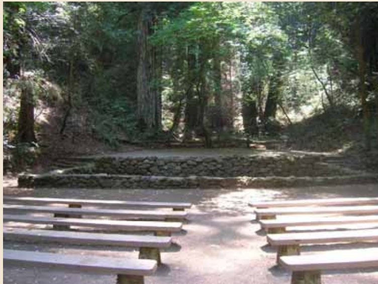
Armstrong Redwoods State Park, CA