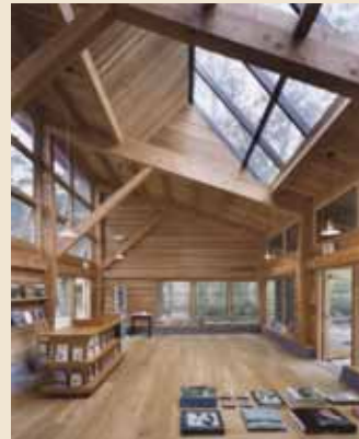
Polly Hill Arboretum West Tisbury, MA