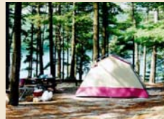
Barrett Pond Camp, Epsilon

"Through the creative use of limited state management resources and partnerships, achieve a sustainable balance between the conservation of important natural and cultural resources, and providing quality outdoor recreation opportunities."