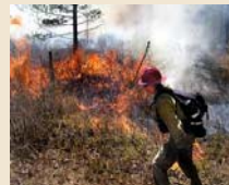
Controlled Burn, DCR