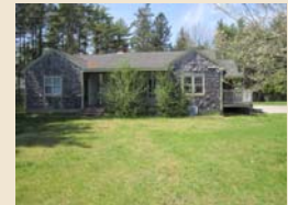
Perry House, DCR