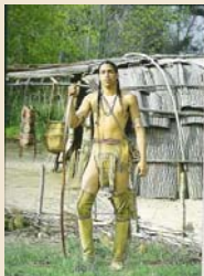
Wampanoag Village, Plimoth Plantation