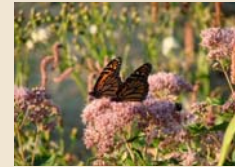
Monarch Butterflies, Bob Conway