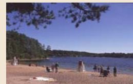
College Pond Day Use Area Beach