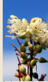
Sweet Pepper-bush, Julie Outencky