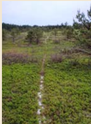
Frost Pocket, Epsilon