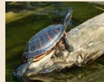
Northern Red-bellied Cooter, VDIGF