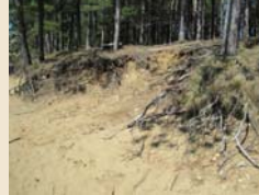
Fearing Pond Shore Erosion, DCR