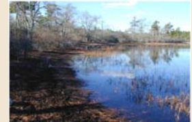
Coastal Plain Pond Shore, Epsilon