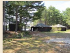
Fearing Pond CCC Log Bathhouse, DCR