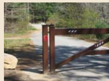
East Head Reservoir Dam Road, DCR