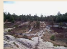
OHV Damage, Tom DeSile