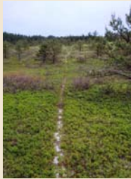
Frost Pocket, Epsilon Associates