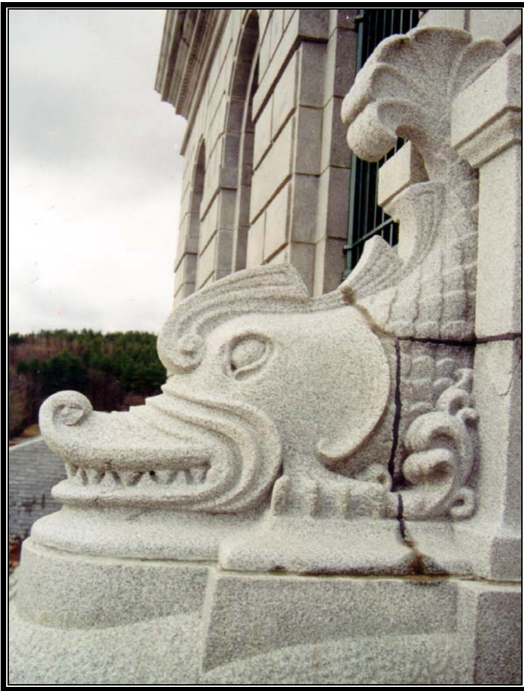
Gargoyle at Sudbury Reservoir Gatehouse