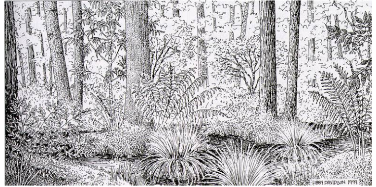
Illustration of black ash swamp by Libby Davidson from Wetland, Woodland, Wildland: A Guide to the Natural Communities of Vermont by Elizabeth H. Thompson and Eric R. Sorenson. Vermont Department of Fish & Wildlife and The Nature Conservancy, 2000.

The shrub layer is variable in cover although relatively high in species diversity. The most characteristic shrub encountered in these swamps is winterberry ( Ilex verticillata ). Other common associates include highbush