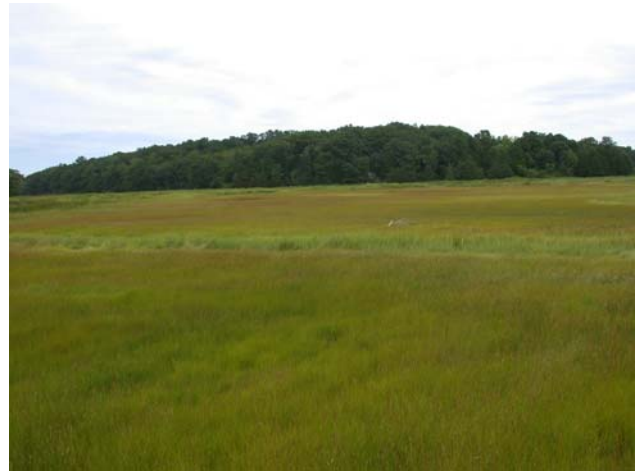
Salt Marsh at Kent's Island, William Forward Wildlife Management Area.

Located between the high spring-tide and mean-tide levels of protected coastal shores, salt marshes comprise one of the most productive ecosystems on Earth. In spite of the stresses of wide variations in temperature, level of salinity, and degree of inundation, the salt-tolerant vegetation of the salt marsh community provides the basis of the complex food chains in both estuarine and marine environments. In addition, salt marshes provide habitat for various species of wildlife – including migrating and over wintering waterfowl and shorebirds and the young of many species of marine organisms. In the northeastern United States, salt marsh communities are dominated by two species of perennial, emergent, halophytic (adapted to growth in salty soils) grasses – Salt marsh Cordgrass ( Spartina alterniflora ) and Saltmeadow Cordgrass ( Spartina patens ). While these dominant species give the community a deceptively simple, grassland-like