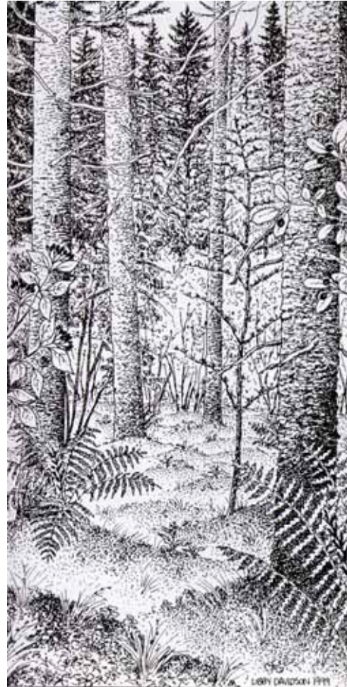
Illustration of spruce-fir swamp by Libby Davidson from Wetland, Woodland, Wildland: A Guide to the Natural Communities of Vermont by Elizabeth H. Thompson and Eric R. Sorenson. Vermont Department of Fish & Wildlife and The Nature Conservancy. 2000.

verticillata ), and an occasional azalea ( Rhododendron spp.) or maleberry ( Lyonia ligustrina ). The herb layer is usually prominent and dominated by cinnamon fern ( Osmunda cinnamomea ). Other potential herbaceous associates are Massachusetts fern ( Thelypteris simulata ), goldthread ( Coptis trifolia ), bunchberry ( Cornus canadensis ), creeping snowberry ( Gaultheria hispidula ), and small amounts of three-seeded bog sedge ( Carex trisperma ). On the drier hummocks starflower ( Trientalis borealis ) and wild sarsaparilla ( Aralia nudicaulis ) may occur in small amounts. Saturated or flooded hollows between the hummocks are carpeted with mosses (primarily Sphagnum spp.) and are typical of Spruce-fir Boreal Swamps.