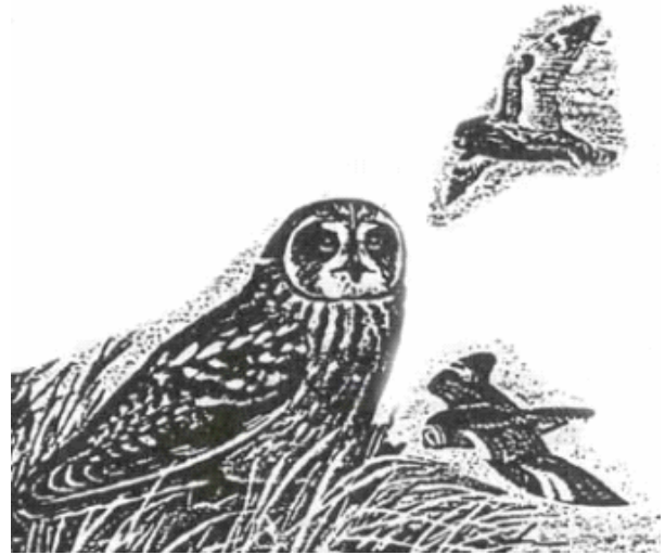
Robbins, C., B. Bruun, and H. Zim. 1966. Birds of North America. Golden Press.

HABITAT IN MASSACHUSETTS: Short-eared Owls in Massachusetts reside in large, undeveloped expanses of coastal sandplain grassland and maritime heathland, habitats which are now almost as endangered as the owl itself. The vegetation of these habitats is comprised of clumped patches of shrubs (bayberry, huckleberry, blueberry, wild rose, dewberry, pitch pine and scrub oak) mixed with herbaceous vegetation consisting of sedges, forbs, and grasses (goldenrod, beachgrass, wild indigo, little bluestem). Short-eared Owl nests on the ground, usually near or within herbaceous vegetation or low shrubs under 1.6 ft. (0.5 m) in height. The territory of a single breeding pair may encompass over 100 acres.