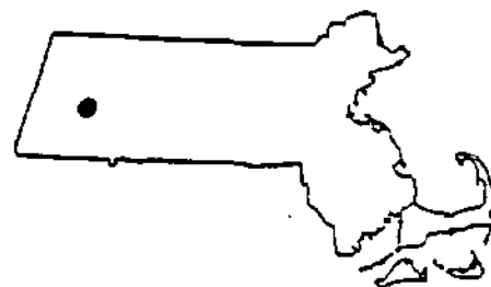
● Verified since 1978