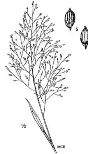
Philadelphia Panic-grass. From: Holmgren, N.H. 1998. Illustrated companion to Gleason and Cronquist's manual: Illustrations of the Vascular Plants of Northeastern United States and adjacent Canada. The New York Botanical Garden, Bronx, NY The illustration gives the general character of the species' panicle, showing the short flag leaf of ssp. philadelphicum .