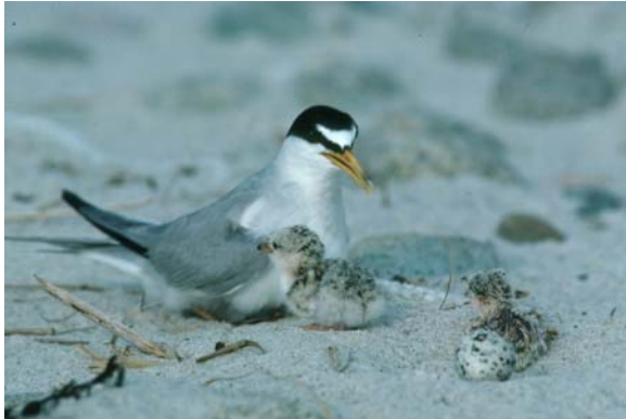
B. Byrne, MDFW

Diminutive yet feisty, the Least Tern is a spring and summer colonial nester on Massachusetts' sandy beaches. For nesting, it favors for sites with little or no vegetation. This preference coincides with humans' most desired spots for recreation and development, resulting in conflicts of use and loss of considerable Least Tern habitat in the past century. Presently, the Least Tern is considered a Species of Special Concern in Massachusetts, and continued management of nesting habitat and colonies is necessary to protect the state's population.