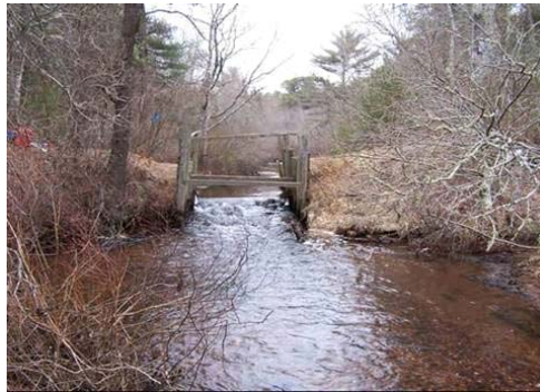
Red Brook Dam Removal, Before and After, Owner the Trustees of Reservations

Riverways works with dam owners to remove failing or unnecessary dams on rivers with high habitat value and where there is community support. Riverways uses its Priority Project program to select dams for removal. After soliciting proposals, staff conducts a rigorous review process that matches the projects with existing resources. Riverways provides (1) technical assistance (2) technical services from pre-approved consulting firms and/or, (3) funding . Riverways works closely with Conservation Commissions, DEP and other permitting agencies to make sure dam removal projects are consistent with state and federal laws and regulations.