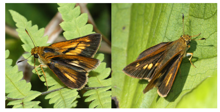
Euphyes dion, dorsal, male • MA: Berkshire Co., Sheffield • 17 Jul 2003 • Photo by M.W. Nelson