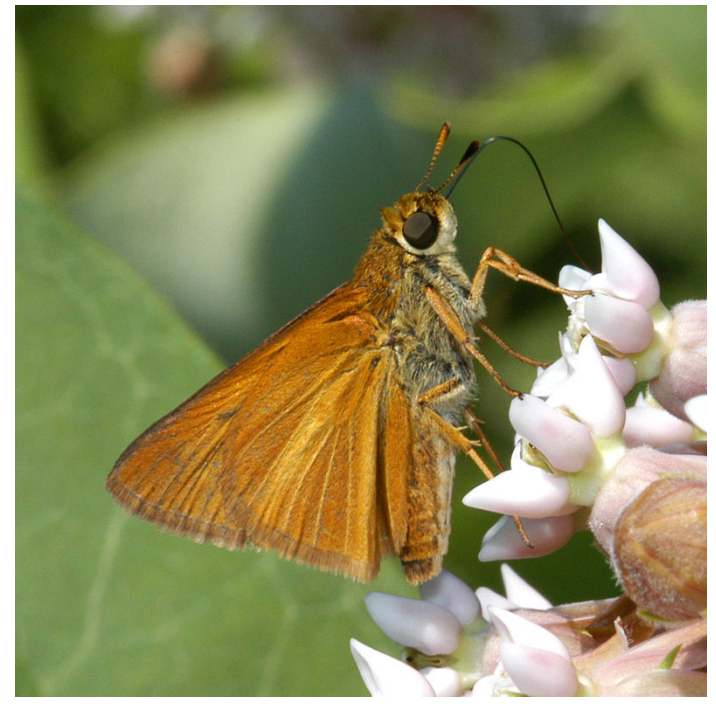
Euphyes dion, ventral • MA: Berkshire Co., Sheffield • 12 Jul 2003