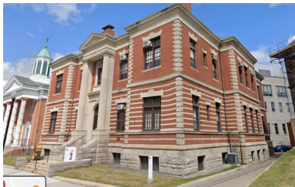
Taunton Registry of Deeds, 11 Court St., Taunton MA

Seven of the eight County-owned buildings are listed on the State and National Registers of Historic Places, and are constructed with historical brick, masonry, copper, and slate materials. County-owned buildings are leased to the Massachusetts Trial Courts, Childrens' Museum and house the County's Registry of Deeds.