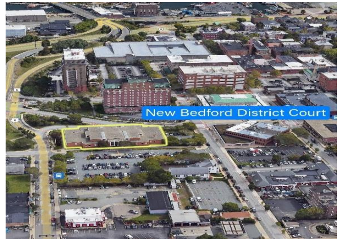
New Bedford 3 rd District Courthouse, 75 No. 6 th St., New Bedford