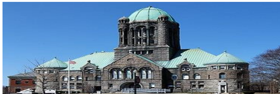
Taunton Superior Courthouse, 9 Court Street, Taunton, MA