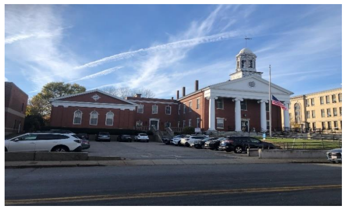
New Bedford Superior Courthouse, 441 County St., New Bedford