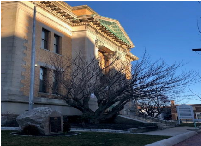
New Bedford Registry of Deeds, 25 No. 6 th St., New Bedford