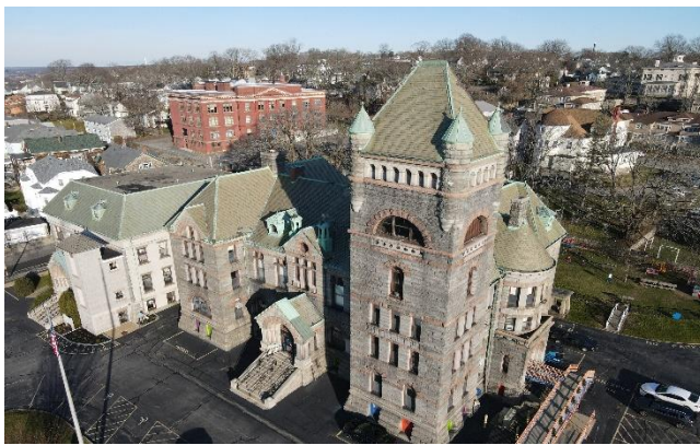
Registry of Deeds & former Superior Courthouse, 441 No. Main St., Fall River