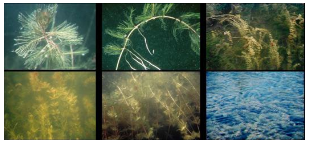
Figure 1. Eurasian watermilfoil plant pictures.

Other milfoils share some of these characteristics. Reproductive parts are the most definitive character. In the absence of flowers and/or seeds, the most distinctive characteristics are the normally reddish stem tips, the 12 or more filaments on each side of the central axis of each leaf, and the truncated leaf tips. This latter feature gives leaf ends the appearance of having been trimmed with scissors.