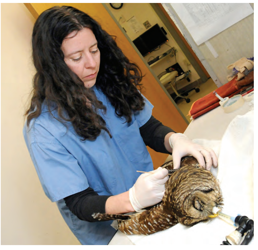
The author, a wildlife veterinarian whose research played a part in the EPA's restriction of some rodenticides due to their effects on raptors, examines a Barred Owl under anesthesia. Whenever a bird of prey is found to be in distress or flightless, rodenticide poisoning is always a possibility that must be investigated.

I immediately gave the hawk an injection of vitamin K_1 , which is the antidote for anticoagulant rodenticide poisoning. Because she had been found and received treatment before she lost too much blood, the hawk was able to make a full recovery. After four weeks of treatment with vitamin K_1 , along with flight reconditioning to rebuild her fitness, the hawk