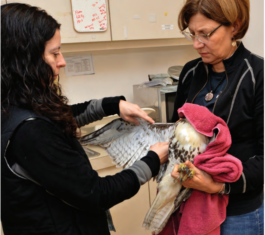
The author, left, shown here examining a Red-tailed Hawk safely restrained by a veterinary technician, tested 161 birds of 4 species (Red-tailed Hawk, Barred Owl, Great Horned Owl, and Screech Owl) that died or had to be euthanized at the Wildlife Clinic from 2006 to 2010. She found that 86% of them had anticoagulant rodenticides in their liver tissue. Of these, 99% had residues of the SGAR brodifacoum, indicating its sale to the general public presents a significant problem for raptors. While the EPA recently banned the sale/use of this chemical for all but agriculture and professional pest control use, producers are allowed to sell their inventories until the end of this year, and products containing it may still be on store shelves until well into 2015.

It is known that insects – a large component of the eastern screech-owl's diet – will feed on rodenticide baits and can accumulate the poisons without being affected by them. In addition, AR residues have been detected in songbirds, as well as in birds that prey on songbirds, such