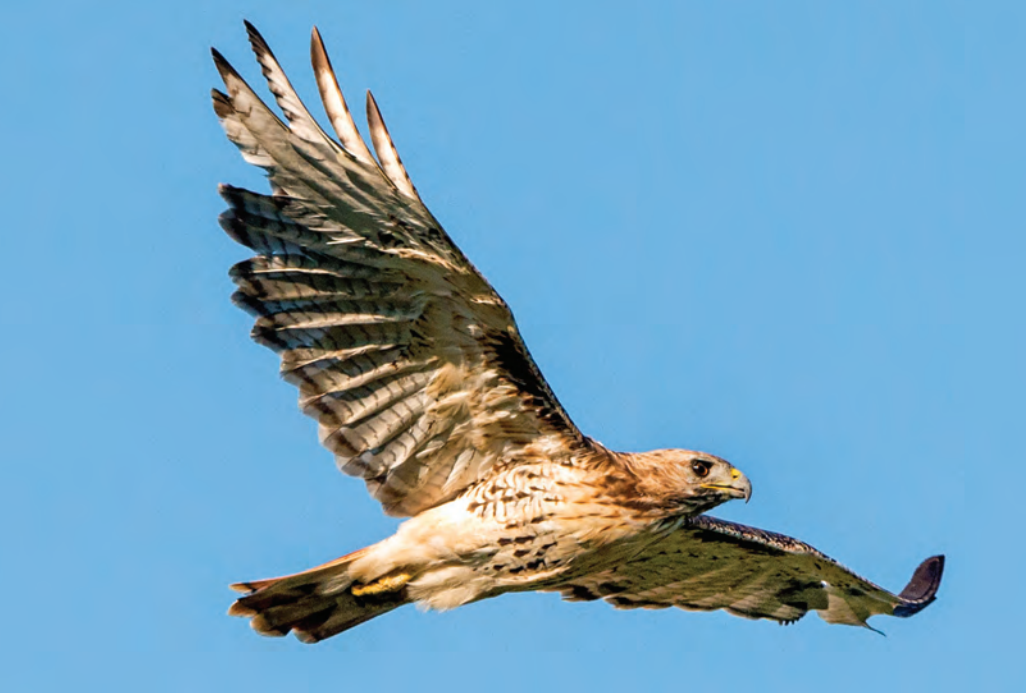
Consider the possibility that you could be responsible for inadvertently poisoning wildlife – and especially certain birds of prey such as this soaring Red-tailed Hawk – if you choose to use a rodenticide to control a rodent problem. Snap traps are a more humane (though more labor intensive) option, but if a rodenticide is used, check the ingredients to avoid brodifacoum, a poison so dangerous to children and wildlife that it is being phased out by the EPA for general consumer sales.

clotting, there are important differences between the two categories. Firstly, SGARs persist in the body, stored in the liver, for a longer time than FGARs. While this property does not offer SGARs an advantage over FGARs for controlling targeted rodents, the longer persistence of SGARs does make them more dangerous to wildlife. The SGARs have been shown to accumulate in the liver over time with repeated feeding. For a red-tailed hawk hunting on its home territory where SGARs are in use. repeatedly feeding on prey containing sub-lethal amounts of SGARs places that bird at risk of accumulating a lethal amount over time.