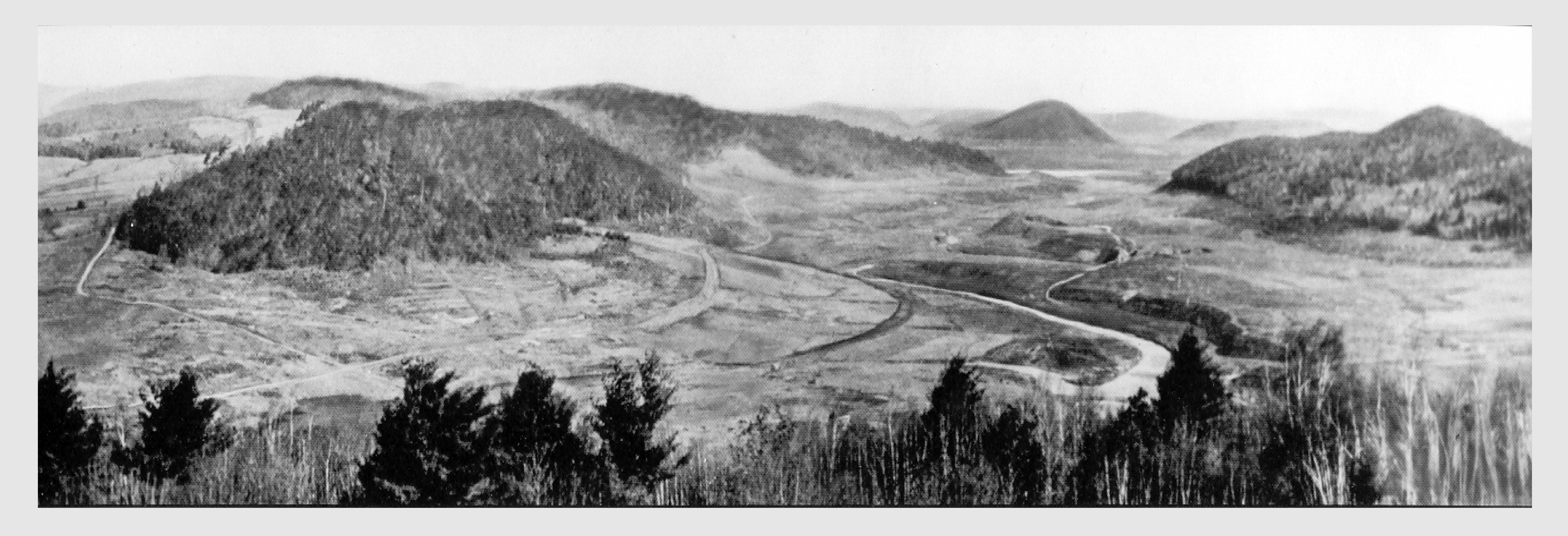
The Reservoir project was begun in 1927 and all land to be flooded was cleared of structures and vegetation. This view shows the site of Enfield Village at the end of the clearing in 1939.