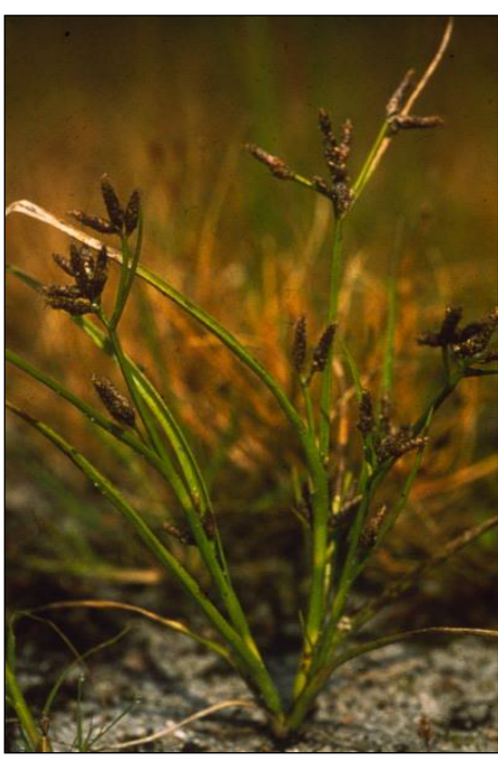
Culms have terminal and axillary flower clusters on glabrous stalks subtended by leafy bracts.

A Species of Greatest Conservation Need in the Massachusetts State Wildlife Action Plan