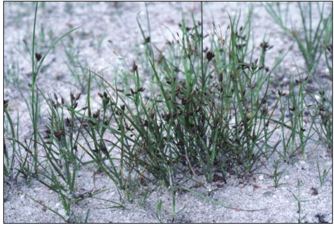
Short-beaked Beaksedge grows on the exposed sand of coastal plain pondshores.