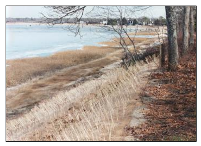
A natural fiber blanket was installed on this bank and vegetation was planted through the blanket while the plants were dormant.

Natural fiber blankets are used on non-vegetated portions of banks to prevent erosion while native salt-tolerant vegetation with extensive root systems becomes established on the site. A salt-tolerant seed mix is spread across the area before the natural fiber blanket is secured, and then live vegetation is planted through the blanket. The blanket helps hold sand, soil, and other sediments in place by protecting the surface from erosion caused by wind, salt spray, and flowing water. The seeds grow quickly and also help secure the soil surface while the larger live plants become established and begin to spread. The blanket also retains moisture to promote seed growth and protect the roots of the live plants. As the natural fibers in the blanket disintegrate over 6 to 24 months, depending on the density and type of fiber blanket selected, the dense root systems of the plants take over the job of stabilizing the site.