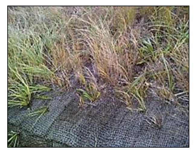
Vegetation growing up through a natural fiber blanket.

No shoreline stabilization option permanently stops all erosion or storm damage. The level of protection provided depends on the option chosen, project design, and site-specific conditions such as the exposure to storms. All options require maintenance, and many also require steps to address adverse impacts to the shoreline system, called mitigation. Some options, such as seawalls and other hard structures, are only allowed in very limited situations because of their impacts to the shoreline system. When evaluating alternatives, property owners must first determine which options are allowable under state, federal, and local regulations and then evaluate their expected level of protection, predicted lifespan, impacts, and costs of project design, installation, mitigation, and long-term maintenance.