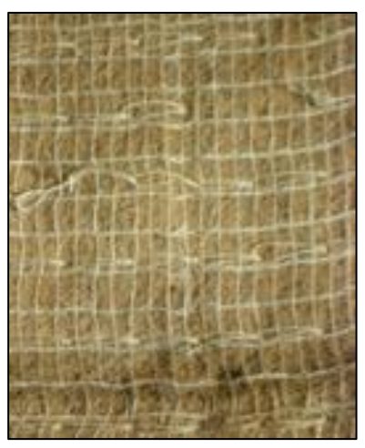
Woven coir blanket.