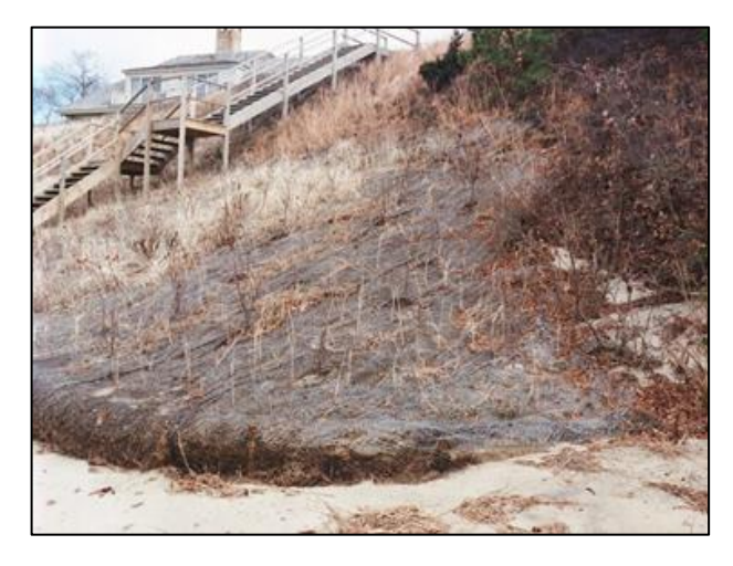
In this bank stabilization project, a natural fiber blanket was installed on the face of the bank and vegetation was planted through it. A coir roll was also installed at the base of the bank.

For important instructions on using plants in bioengineering projects, see the <u>StormSmart Properties Fact Sheet 3: Planting</u> <u>Vegetation to Reduce Erosion and Storm Damage</u>. This fact sheet includes specific information on how vegetation reduces erosion and storm damage, tips on maximizing the effectiveness of vegetation projects and minimizing impacts, specifics on project design and implementation, and instructions on selecting, properly planting, and caring for appropriate species.