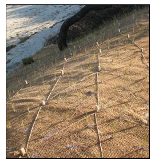
Oak stakes are used to anchor the natural fiber blanket installed on this bank. A notch in the stake is used as a stop to hold biodegradable coir twine to secure the blanket to the ground surface. Vegetation was planted through the blanket.

When natural fiber blankets are used to cover the entire slope of a bank, anchor trenches are often used. Anchor trenches are small depressions, typically 6-12 inches deep by 6 -8 inches wide that are dug parallel to the shoreline. In this approach, the blankets run from an anchor trench at the top of the bank, down the bank face to another anchor trench at the bottom of the slope. The trenches are backfilled with sediments similar to those found on the bank or beach and compacted so water will flow evenly over the blanket and not under it.