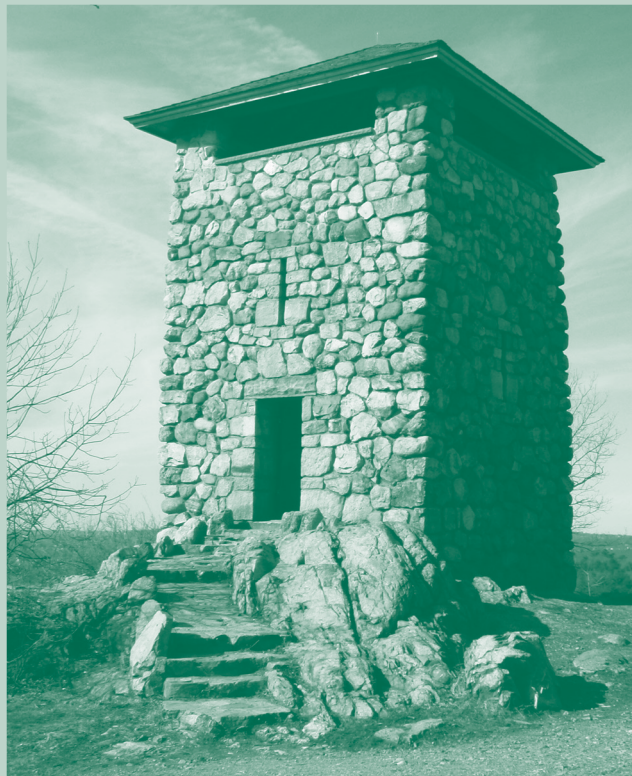
Open – weather permitting