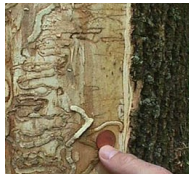
Serpentine galleries under bark (USDA)