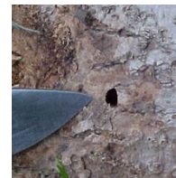
D-shaped exit hole