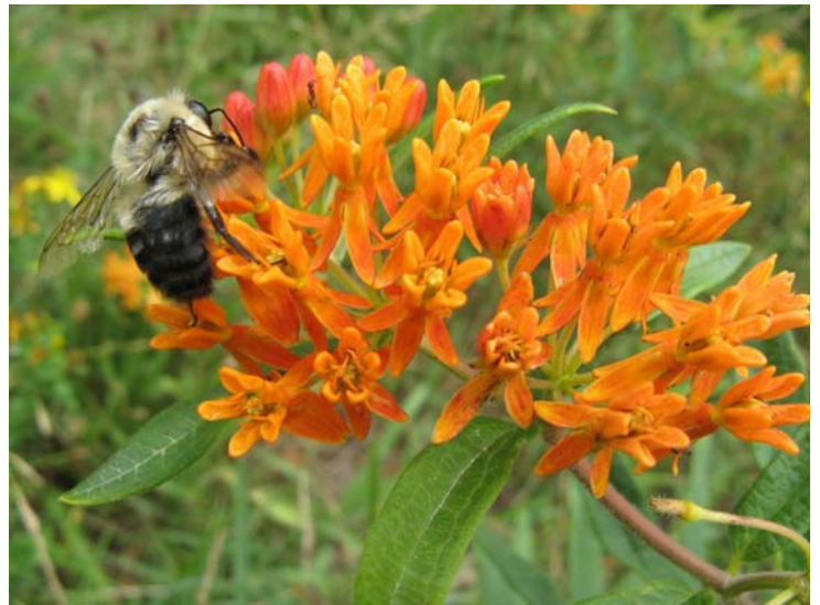
Butterfly-weed (also called Orange Milkweed) with pollinator.

Range: The documented range of butterfly-weed extends from southern New Hampshire south to Florida and west to Minnesota, South Dakota, Arizona and Mexico.