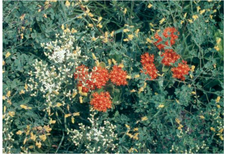
Butterfly-weed and commonly associated species in a sandplain grassland habitat.

in receiving information about any populations). Most sites are in the southeastern section of the state, with scattered sites located to the northeast and into the Connecticut River valley. Butterfly-weed's numbers and range within the state are reduced from early in the 20 th century; many old stations for this species no longer exist. Causes of this decline include habitat destruction, succession to woody plants (caused by fire suppression and a lack of grazing), and transplanting and collecting by wild flower enthusiasts. In recent times, habitat destruction has been the most critical of threats to this species.