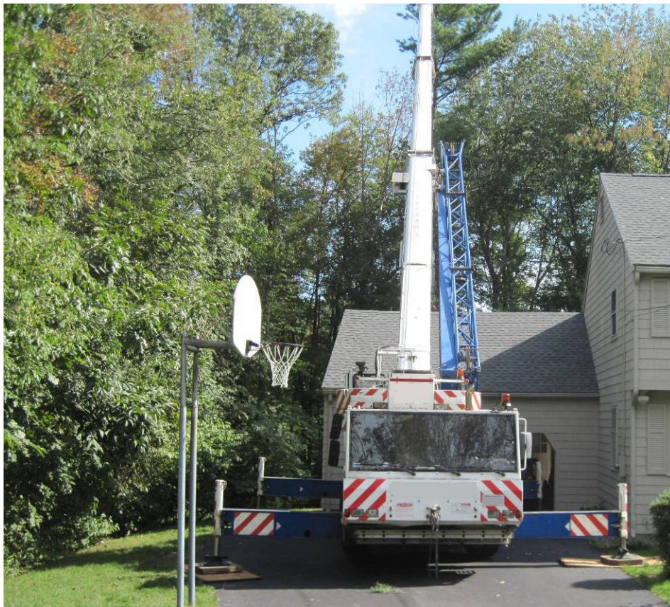
Figure 1 – Crane positioned in the driveway of the home