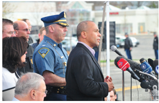
Third Press Conference in Watertown

The Governor, Mayor of Boston, MSP Superintendent, Watertown PD Chief, BPD Commissioner, MEMA Director, Transit PD Chief, FBI SAC, US Attorney, and other public safety and elected officials held a press conference at 6:03