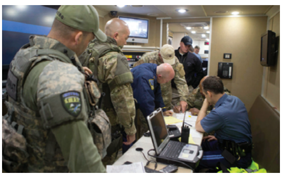
Law Enforcement Personnel Developing Grid Search for Suspect At Large