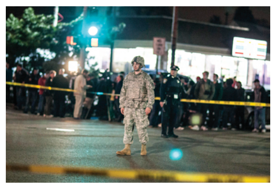
National Guard Supporting Perimeter Security in Watertown