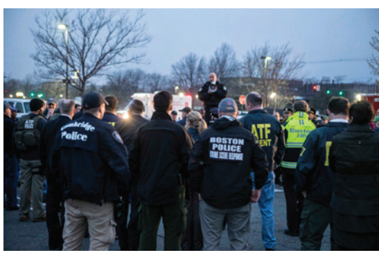
Officers at the Staging Area

As the search went on, a number of leads were identified, including one at the University of Massachusetts in Dartmouth, where the suspect attended school. To quickly investigate this lead, the FBI needed helicopters to fly agents, BPD officers and MSP SWAT teams. MANG quickly coordinated the deployment of three Blackhawk helicopters to fly these assets to Dartmouth.