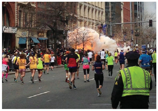
Site 2 - Second Explosion

ately checked pre-deployed air monitoring devices in the area of the Finish Line for potential contamination from the IEDs. The initial readings showed no presence of contamination from the bombs. This information was communicated quickly to on scene commanders, but was not relayed to hospitals. Though initial readings were negative, the JHATs continued to monitor the air to ensure the explosions were not "dirty" bombs.