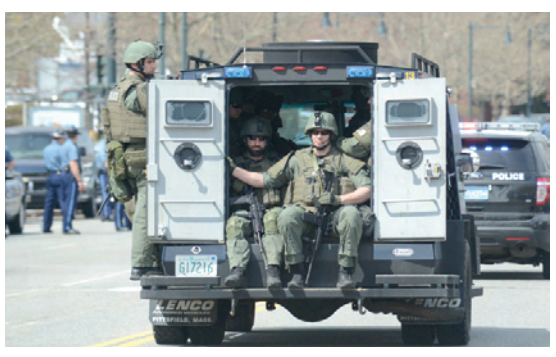
SWAT Team in Watertown

Waltham, Belmont, Cambridge and the Allston-Brighton neighborhood of Boston. After some discussion, the recommendations of the UC were accepted and authorized.