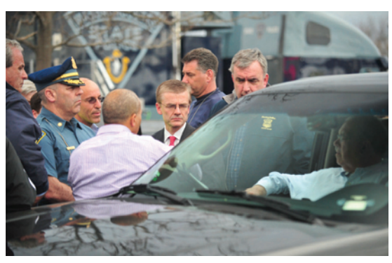
Members of Unified Command meet with the Governor and Mayor

Around 7:15 a.m., the UC received a report that a suspicious person carrying a package