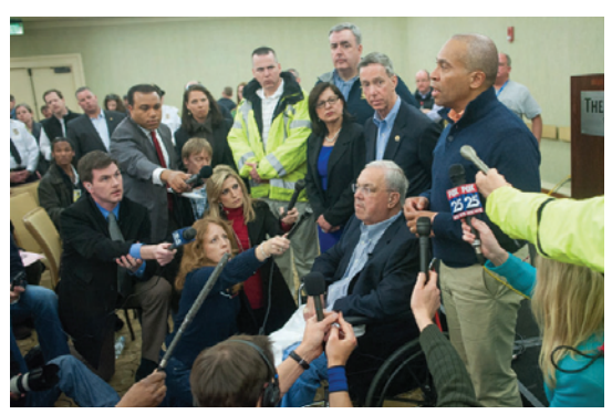
Second Press Conference

city, state and federal resources were on scene or en route to the scene to assist in the response.<sup>37</sup> The public was asked to go home or to their hotel rooms and not congregate around the City. Lastly, it was announced that two hotlines had been established: the first, the Mayor of Boston's 24-hour constituent Help Line, could be used by individuals looking for family members; the second, a law enforcement tips hotline, could be used by those who may have witnessed anything around the time of the bombings.<sup>38</sup>