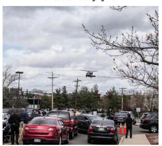
Blackhawks Near Staging Area

Although the helicopters were flown by combat-trained pilots who were experienced in flying into tight spaces under combat conditions, finding a landing zone in Watertown large enough to safely put down the helicopter was challenging. MANG quickly searched for a landing zone near the Arsenal Mall parking lot where the bulk of the out-of-town police had staged, and identified an area that was just large enough for a helicopter to land. Several vehicles had to be towed from this area to make sufficient space available to land the helicopters.