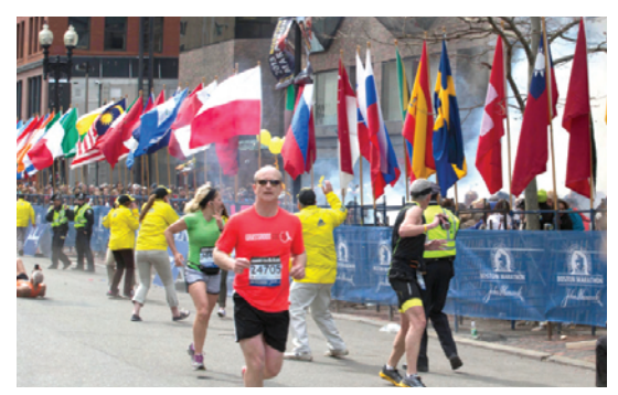
Moments after the first explosion at Site 1.

an initial flash of fire, no buildings collapsed or suffered significant structural damage, nor did any fires burn beyond the initial explosions.