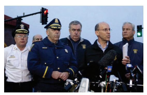
First Press Conference Announcing the Shelter-in-Place Request and Suspension of the Transit System

At 5:15 a.m., the UC conducted a conference call with the Governor and Mayor of Boston to recommend the following protective actions: suspension of all MBTA service and the sheltering-in-place of Watertown, Newton,