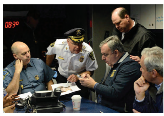
Members of Unified Command at the Unified Command Center

By 5:30 a.m., tactical plans for the grid search were finalized and a systematic door-to-door search for the suspect at large began. A Tactical Operation Center (TOC) was stood up at the command post