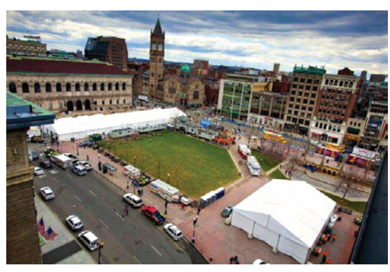
Alpha Medical Tent (upper left white tent)

Triage and treatment groups were immediately established at the Finish Line. Alpha Medical