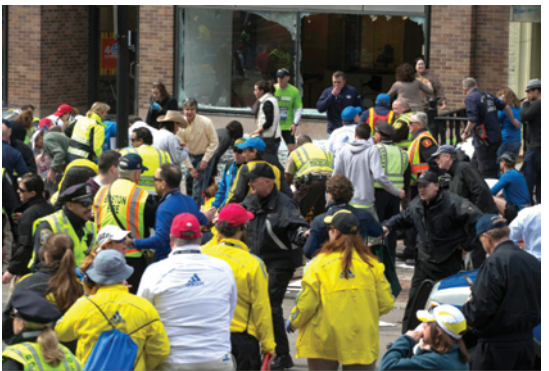
Medical Response at Site 1

At the time the bombs were detonated on Marathon Day, there were 16 ambulances prestaged in Copley Square. In response to a 2:55 p.m. Boston Area Medical Alert (BAMA) radio broadcast by Boston EMS requesting additional ambulance assets, an additional 73 ambulances, including assets from private ambulance companies, staged within minutes to support the incident. Thirty Boston EMS ordered all EMS units via radio to stay at their locations until the exact location of the blasts and scope of the incident could be determined. EMS units that had staged outside the blast area maintained discipline, standing fast until ordered to respond to the scene.