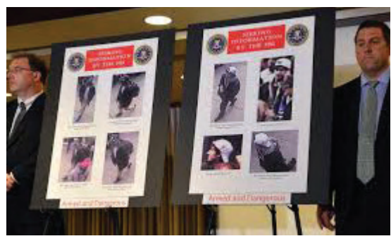
FBI Unveils Images

At 10:31 p.m., MIT PD put out a broadcast over the BAPERN radio network that one of their officers had been fatally shot on their campus in Cambridge. Cambridge PD and MSP responded to the scene. <sup>40</sup> At 11:16 p.m., Cambridge PD issued a "Be On the Look Out" (BOLO) for the armed robbery suspect. <sup>41</sup> Transit PD received