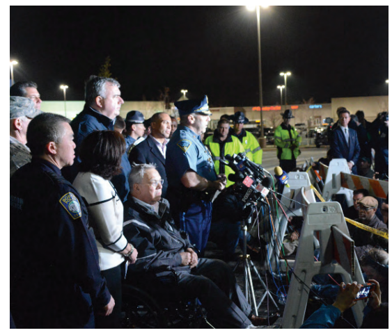
Final Press Conference in Watertown Announcing Apprehension of the Suspect

A final on scene press conference was held at 9:32 p.m. with the Governor, Mayor of Boston, MSP Superintendent, BPD Commissioner, Watertown PD Chief, Transit PD Chief, US Attorney, FBI SAC, ATF SAC, and other public safety and elected officials to announce that the