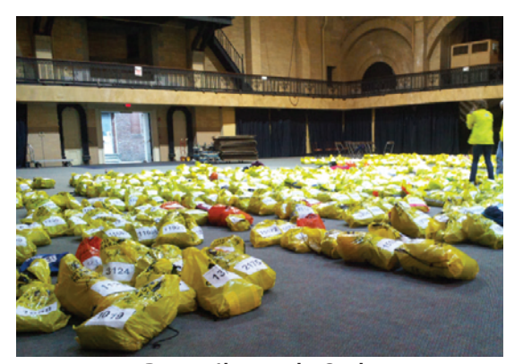
Runners' bags at the Castle

Once the Castle operation stood down, services were transferred to the City Year Program headquarters in Boston. City Year opened one of its function rooms for counseling services, and organized other services, including bringing in a nurse. BCYF worked with the Mayor's press office to announce this change, posted notice at the Castle, and distributed information through social media and on the websites of City departments and agencies.