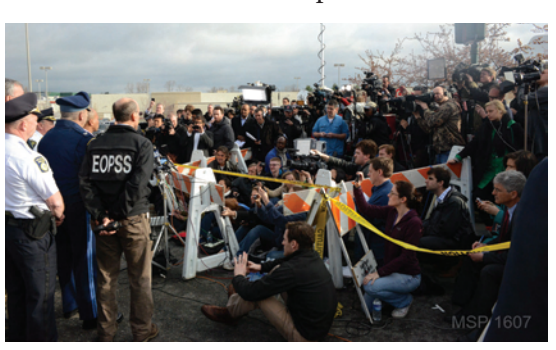
Media Presence During Second Press Conference in Watertown

Agencies should ensure that more than one person within the agency can access notification tools and official social media accounts.