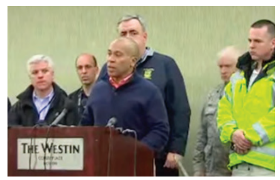
First Press Conference

The first press conference was held at 4:47 p.m. It was relatively brief, with the Governor and Boston Police Commissioner making well-coordinated and informative statements. During this press conference, information about the incident was confirmed, including: two bombs had been detonated near the Finish Line and a large number of people had been injured; all injured parties had been transported from the scene; no additional devices had been found in the vicinity of the Finish Line, but packages left behind by spectators fleeing the area were still being assessed; a third explosion, suspected to be related, had occurred at the JFK Library; officers had been deployed to hospitals to speak with families and witnesses; and all available