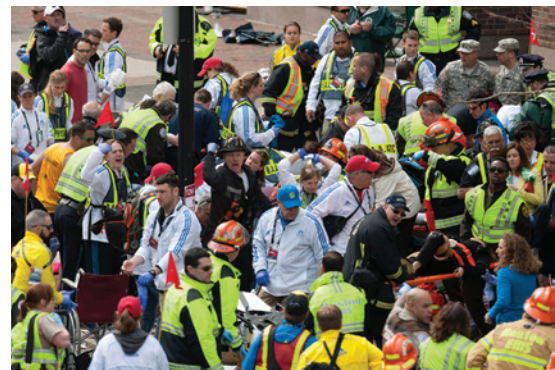
Medical Response at Site 1

Medical Tent. These loading officers, in coordination with MetroBoston Central Medical Emergency Direction (CMED), coordinated patient transports by directing ambulances to certain hospitals. CMED is the coordination dispatch center, located in Boston EMS Dispatch, that assigns patient transports to hospitals based on patient condition, specialty needs, and citywide hospital capacity to ensure no one hospital emergency department is overloaded.<sup>31</sup> Brigham and Women's Hospital received 23 patients, the most bombing survivors of any hospital. The distribution of patients across hospitals prevented any one hospital from becoming overloaded.