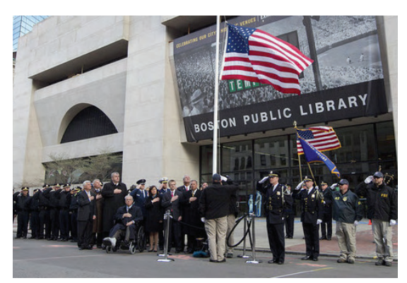
Flag Ceremony Honoring the Return of Boylston Street to the City of Boston

On Monday, April 22, the City learned that the FBI wanted to have a ceremony the following evening, at which time a flag would be given to the Mayor signifying the formal return of the crime scene area to the City of Boston. Upon conclusion of the ceremony, the City would be permitted to allow work crews, residents, and businesses back into the area. OEM requested all EOC liaisons be at the EOC by 3:00 p.m. on Monday for a full activation of the EOC to ensure