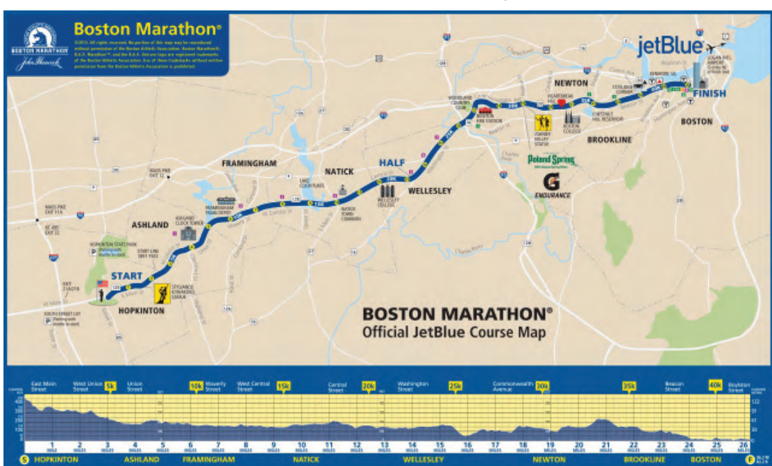
Official Boston Marathon Course Map

Because of this, a great deal of public safety planning is required each year for the Marathon to ensure streamlined coordination among public safety partners at the local, regional, state and