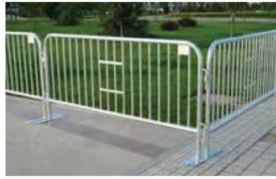
Interlocking bicycle rack.

While the racking was effective in assisting with crowd control during the race, it proved to be a challenge to responders when attempting to access the injured after the bombings. The