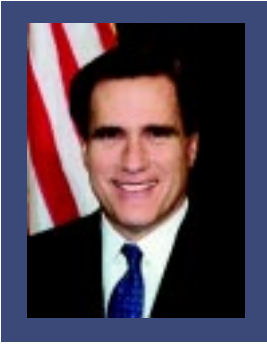
Mitt Romney Massachusetts Governor