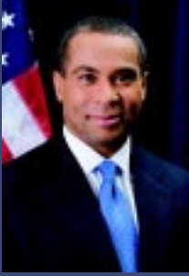
Deval L. Patrick Massachusetts Governor

The Massachusetts Export Center is committed to helping the state's businesses succeed in today's global marketplace.