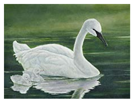
Trumpeter Swan by Xiaomei Chen, Grade 12. Junior Duck Stamp Best of Show from Massachusetts and Top 25 National.

You can be a significant part of the celebration of youth, art, and conservation as 2015 marks the 20th anniversary of the Junior Duck Stamp Program in Massachusetts. To help increase the statewide flock of youth artists, I invite birders, sportsmen, educators, parents, grandparents, and others to encourage, cultivate and support youth who have an innate interest in art and conservation. Take a child outdoors to observe waterfowl and be part of reconnecting youth creatively with the natural world. They are the future!