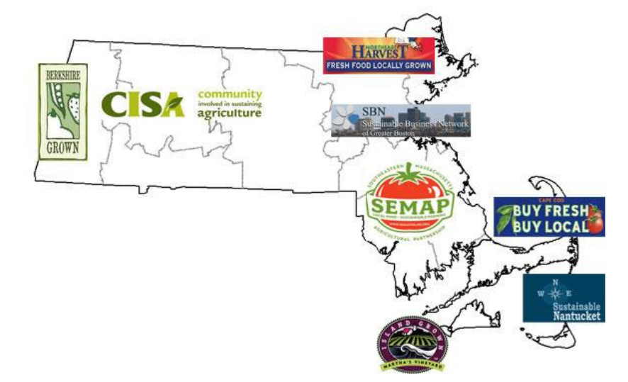
Figure 8: Buy Local Groups.

Shift to alternate varieties or products. Evaluate means to alter farming practices and shift crop preferences to products better suited to greenhouse cultivation or new climate conditions.