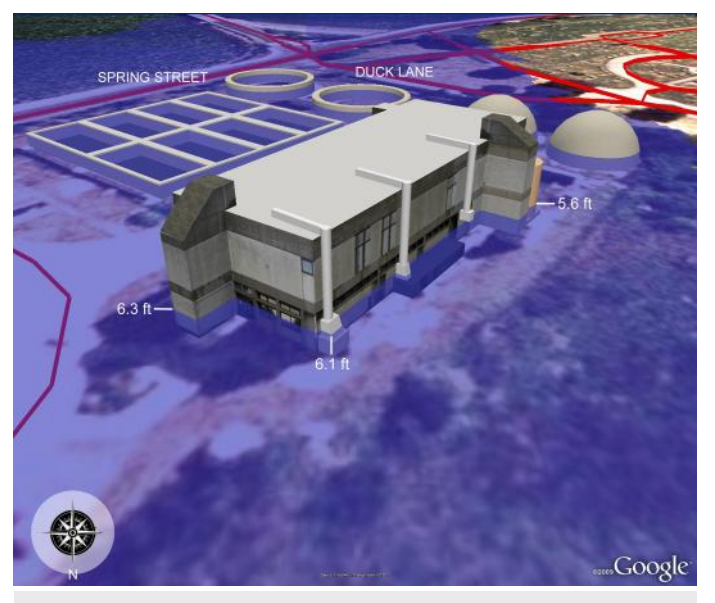
Figure 9: WasteWater Treatment Plant in Hull, MA: Simulated flooding around a critical facility from base flood plus 3.3 feet of sea level rise.

Base flood (i.e., a 100-year flood) elevations taken from FEMA Preliminary Digital Flood Insurance Rate Map for Plymouth County (11-7-2008). Labels represent flood water depths measured from building foundation at ground level. Source: <u>http://www.mass.gov/czm/stormsmart/</u> <u>resources/hull inundation report.pdf</u>