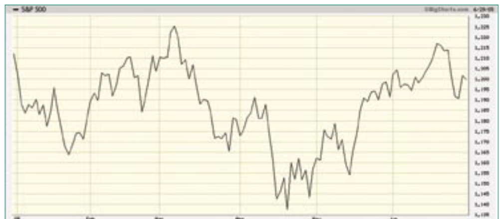
Chart reprinted with the permission of www.bigcharts.com .