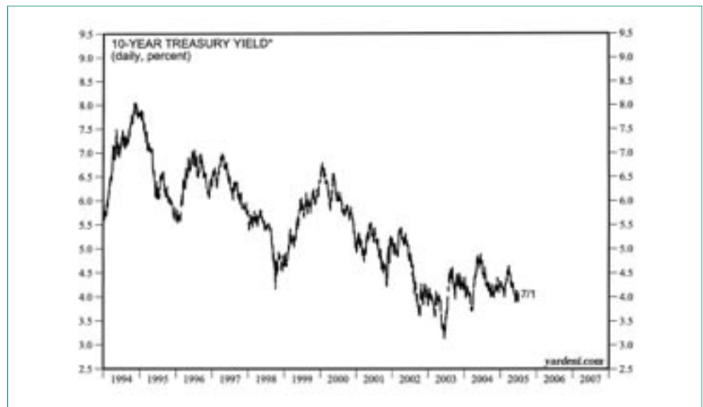
Chart reprinted with the permission of www.yardeni.com .