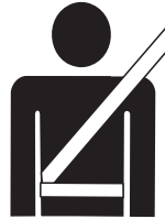
The right way to wear a safety belt.

In a crash, a correctly fastened safety belt can help in many ways.