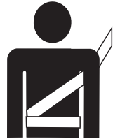
The wrong way to wear a safety belt.