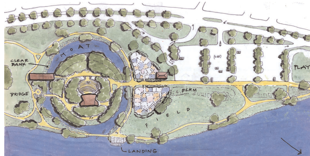
A DETAIL OF THE CONCEPTUAL DESIGN FOR HERTER PARK, WHICH WOULD SIMPLIFY SOME OF THE PATHS ALONG THE RIVER. THE PHOTO BELOW SHOWS THE EXISTING CONDITIONS.