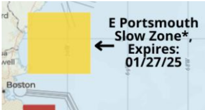
Figure 2: NOAA Fisheries Voluntary Dynamic Management Area

For more information on Right Whale Slow Zones and Dynamic Management Areas, click here .