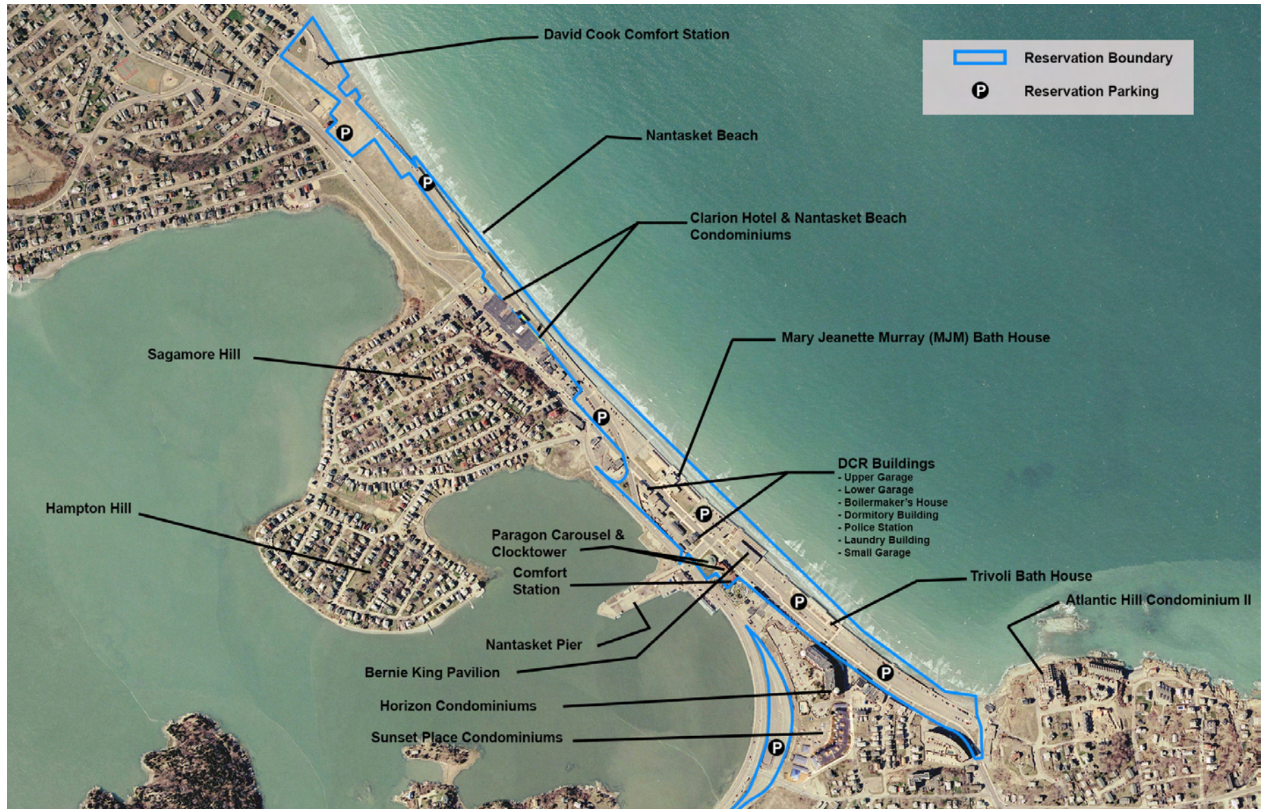
Location of the Reservation and significant features within and adjacent to it.