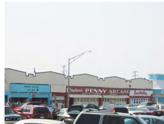
The arcades across Nantasket Avenue from the Tivoli Bath House and Bernie King Pavilion.