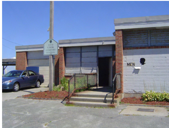
From top: View of the Comfort Station from Nantasket Avenue; view of the David A. Cook Comfort Station from Hull Shore Drive.