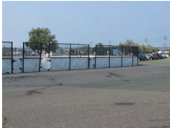
From top: Existing promenade and parking lots have minimal amenities; view of skating rink in the overflow lot on George Washington Boulevard.