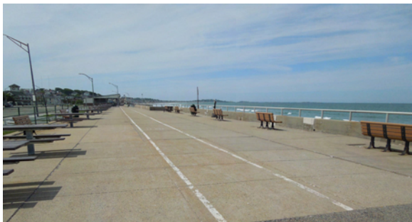
From top: The beachfront plaza adjacent to the Bernie King Pavilion; view of the Tivoli Bath House from the south; view of the beachfront plaza north of the Tivoli Bath House.