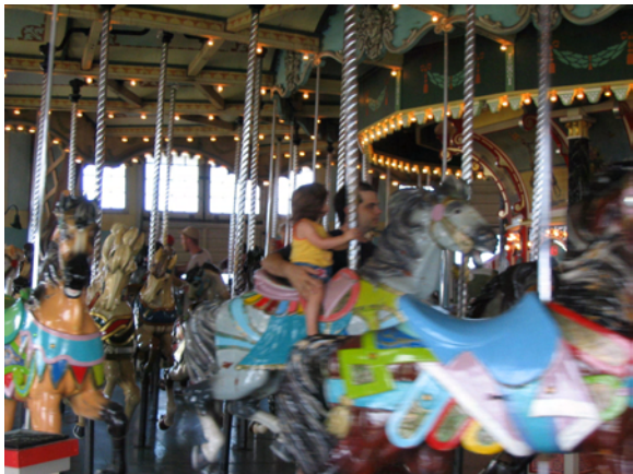
From top: View of the Paragon Carousel and Clocktower Buildings; closeup of the Clocktower Building; fun on the carousel.