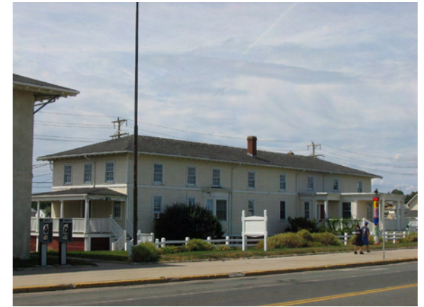
View of the Dormitory Building from Nantasket Avenue.

The two-story Dormitory Building has an area of approximately 9,000 square feet and is in overall poor condition. It was originally built in 1898 and used