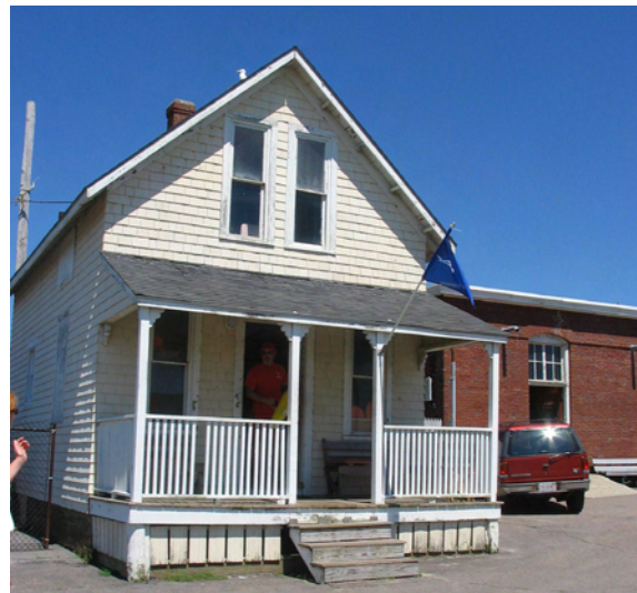
From top: View of Upper Garage from Nantasket Avenue, with art studios opened to the sidewalk; view of the Boilermaker's House.