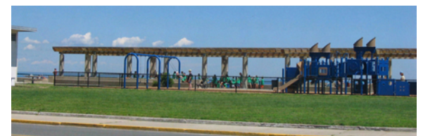
From top: View of Mary Jeanette Murray Bath House from Nantasket Avenue; pergolas adjacent to the MJM Bath House provide a popular semi-shaded gathering area; the playground to the south of the bath house.