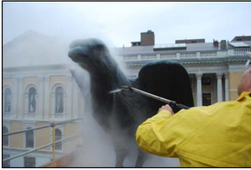
Fig. 3: Bronze eagle is cleaned with high pressure water

The bronze was completely re-patinated after tests were reviewed for color (Fig 4), and welding seams refilled and in-painted. The eagle was then waxed to protect it from the elements.