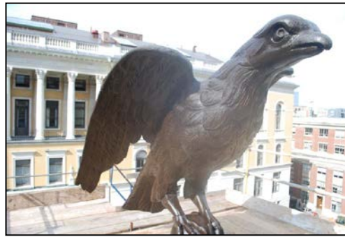
Fig. 5: Beacon Hill Monument eagle after treatment.

The granite monument and the slate tablets were cleaned with high pressure water and mild detergents which removed the heavy greenish cast caused by oxidation of copper inclusions in the granite that had washed down over the monument for the past 110 years. The eagle was placed on the Art Commission's long range schedule for maintenance, insuring that it will receive structural inspection and more frequent care.