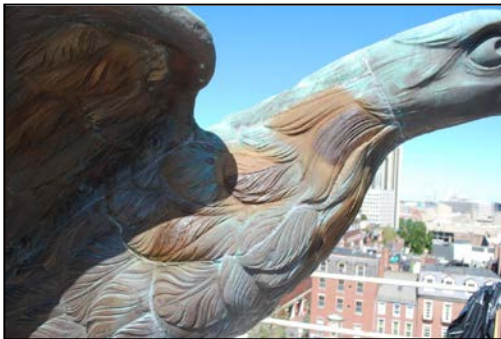
Fig. 4: Test patinations

The bronze was completely re-patinated after tests were reviewed for color (Fig 4), and welding seams refilled and in-painted. The eagle was then waxed to protect it from the elements.