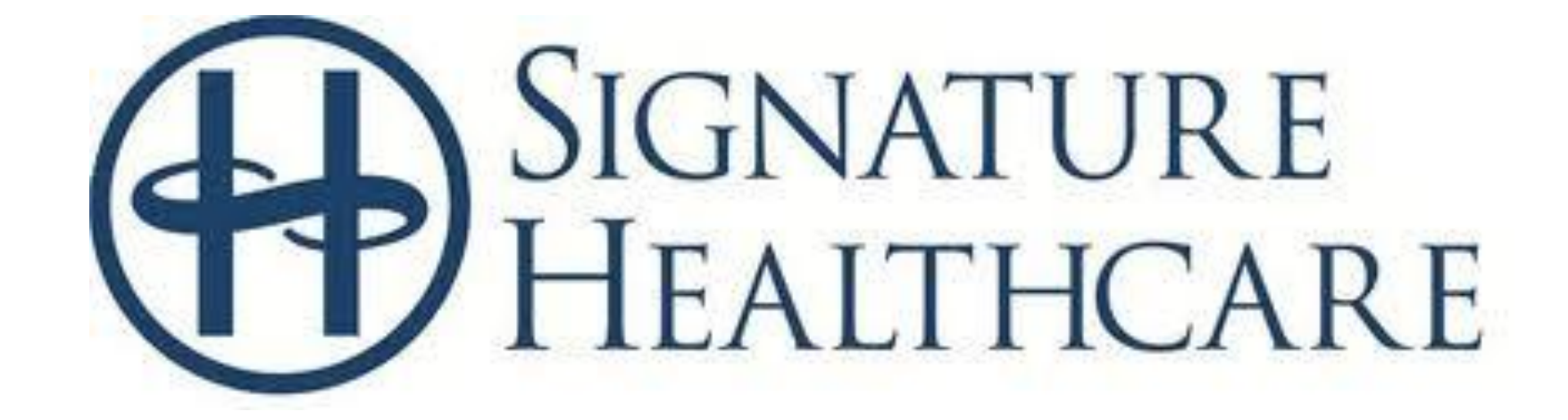
CHART Phase 1 awardee presentation