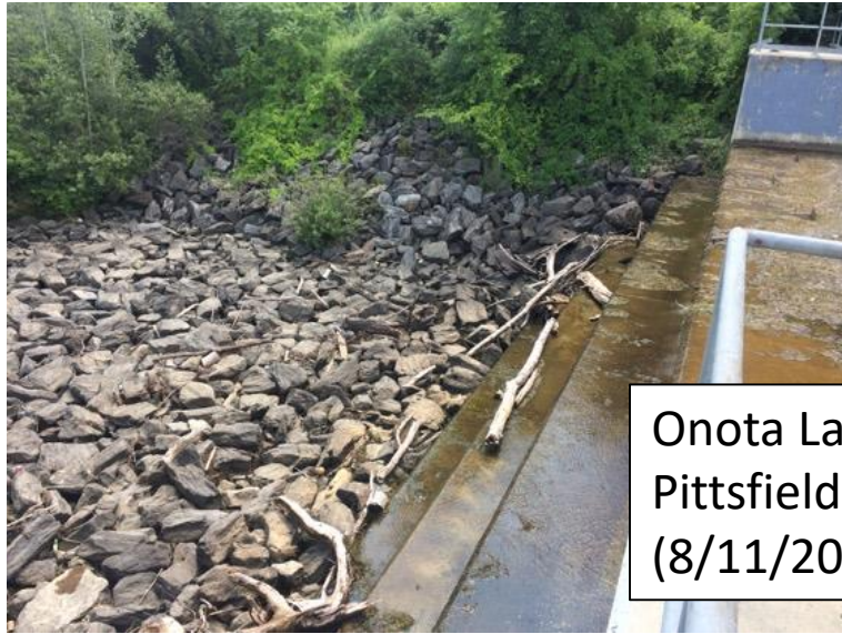
Onota Lake, Pittsfield (8/11/2020)