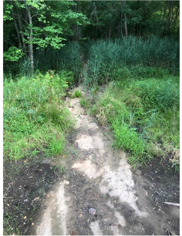
Buttonwood Brook, Dartmouth (early August – still dry)