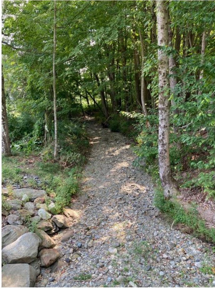
Churchill Brook, Pittsfield (8/24/2020)