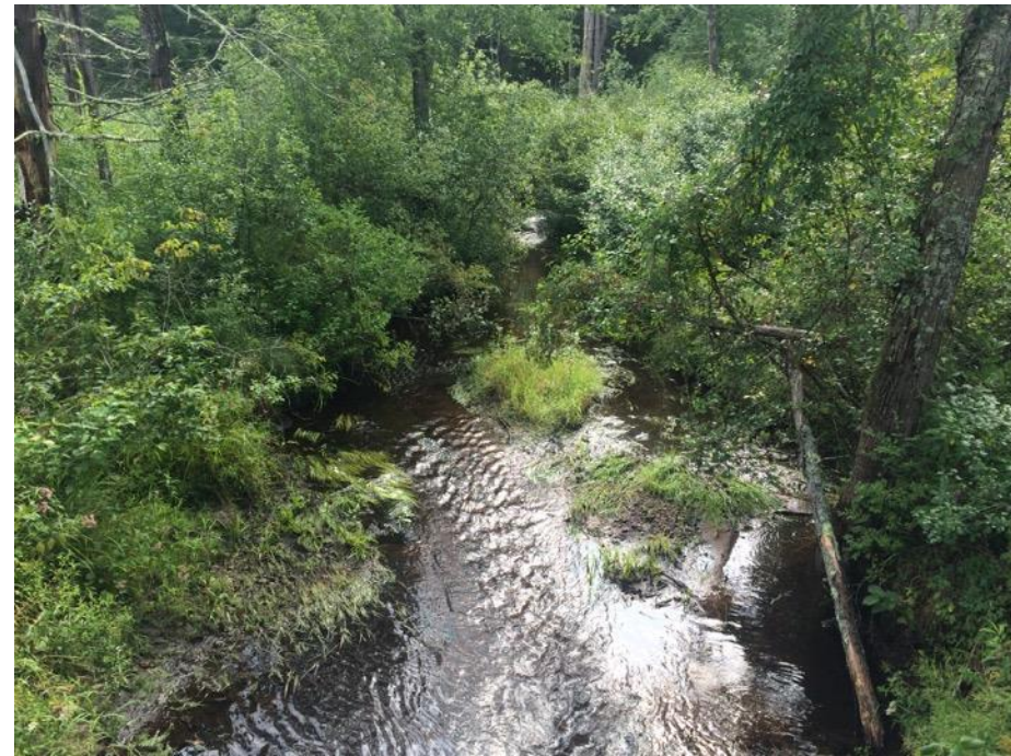
Parkers Brook, Oakham (8/25/2020)

*Photos taken after bump in flow due to rain previous day; hydrological data show decreasing flow through month of August