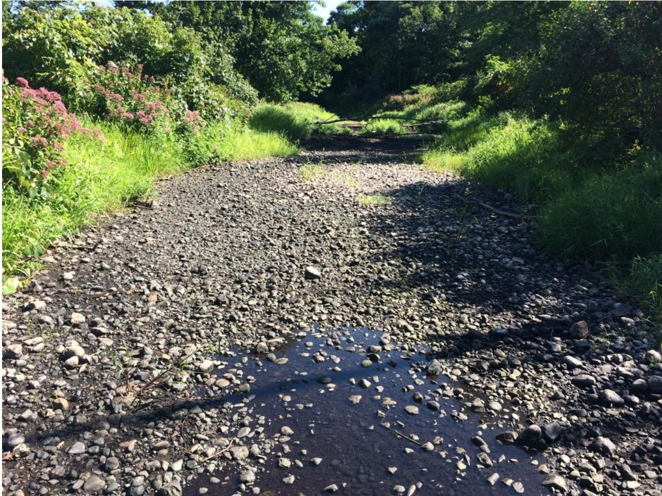
Stony Brook, Chelmsford (8/21/2020)