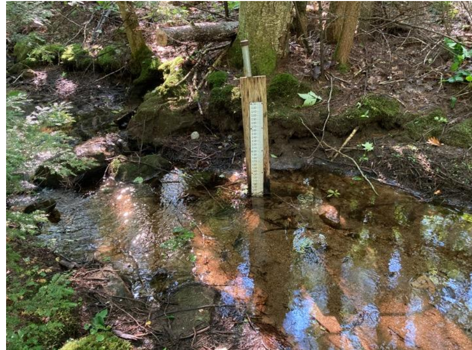
Nurse Brook, Shutesbury (8/3/2020)