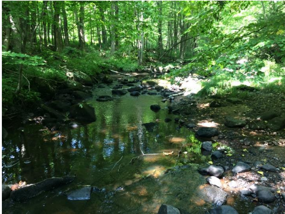
Browns Brook, Holland (8/25/2020)