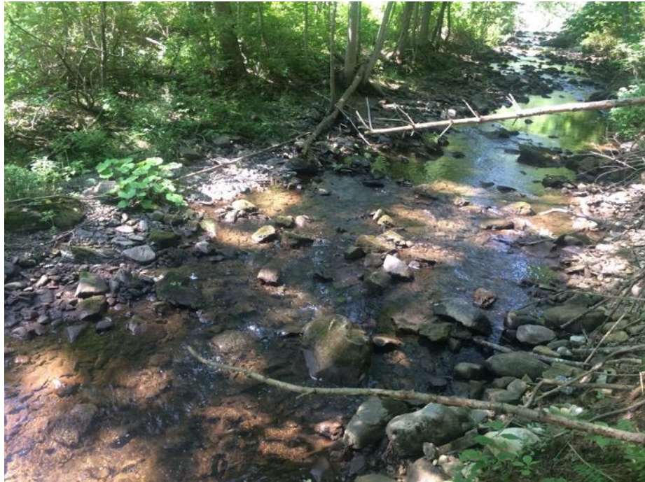
Cone Brook, Richmond (8/11/2020)