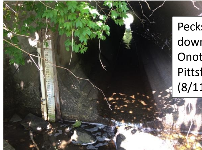
Pecks Brook downstream Onota Lake, Pittsfield (8/11/2020)