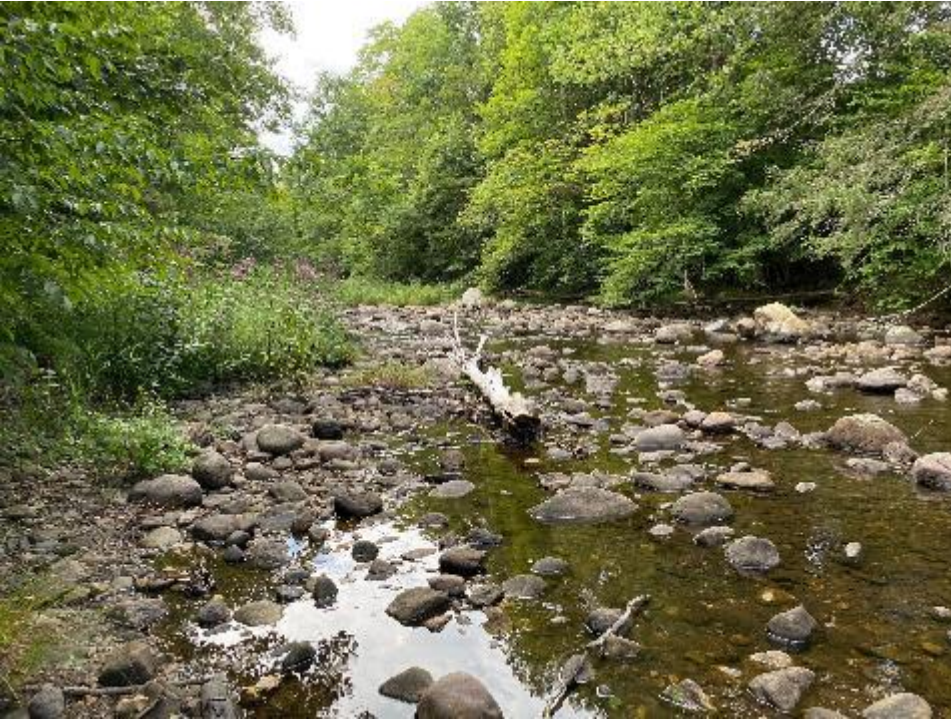
West Branch Farmington River, Otis