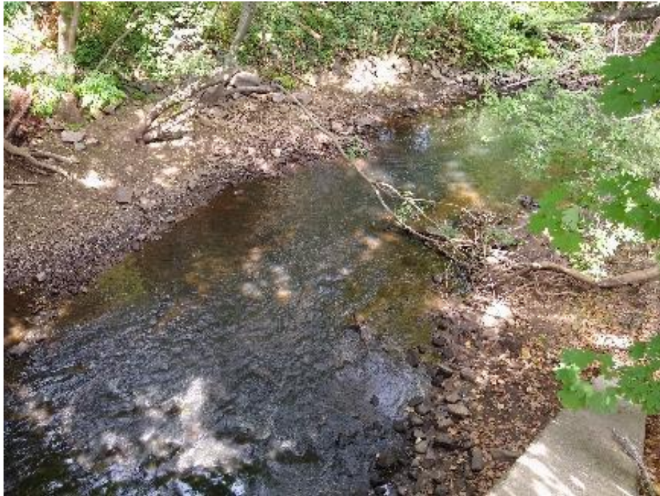
Loring Street, Lawrence