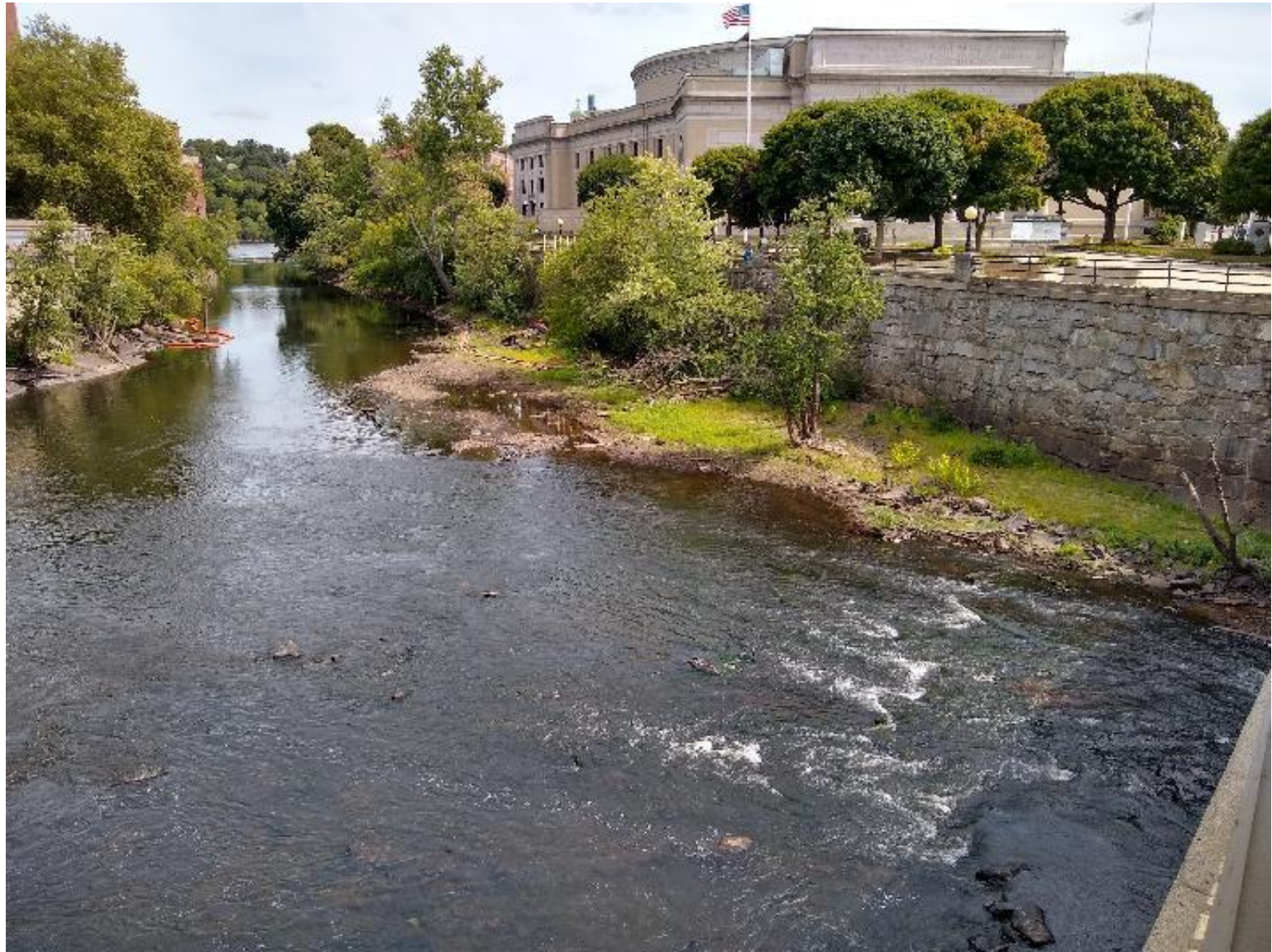
River Merrimack