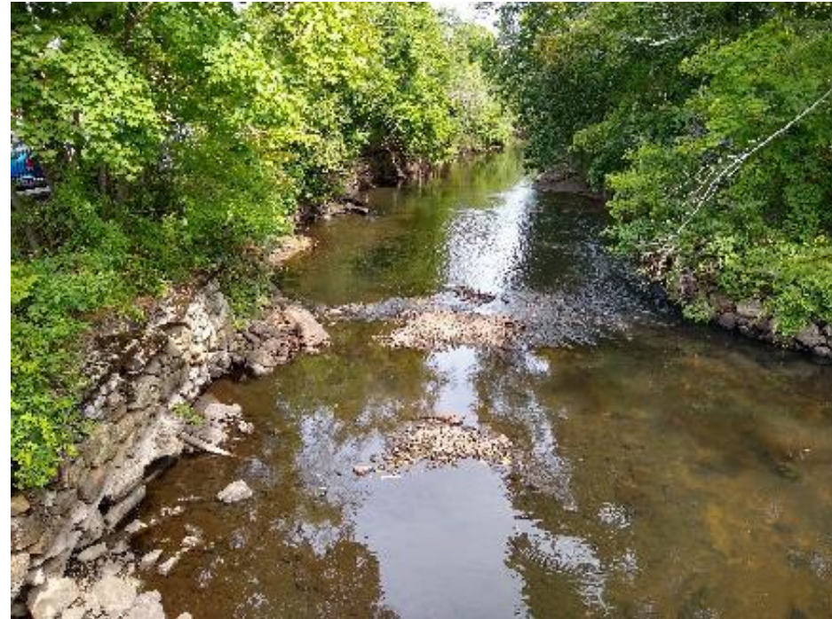
Balmoral Street, Andover