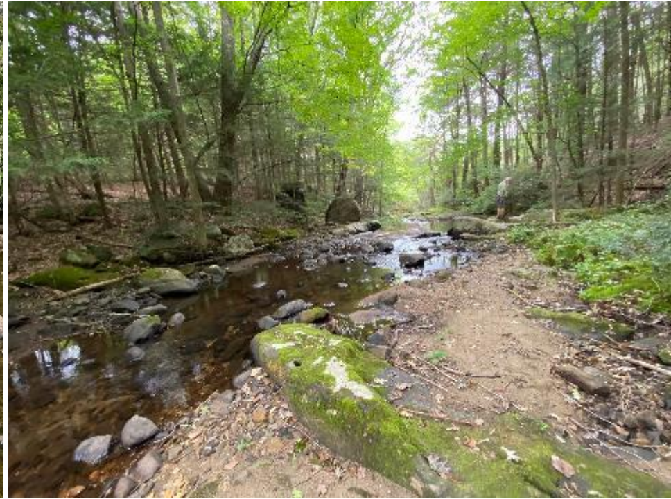
Hubbard Brook, Granville