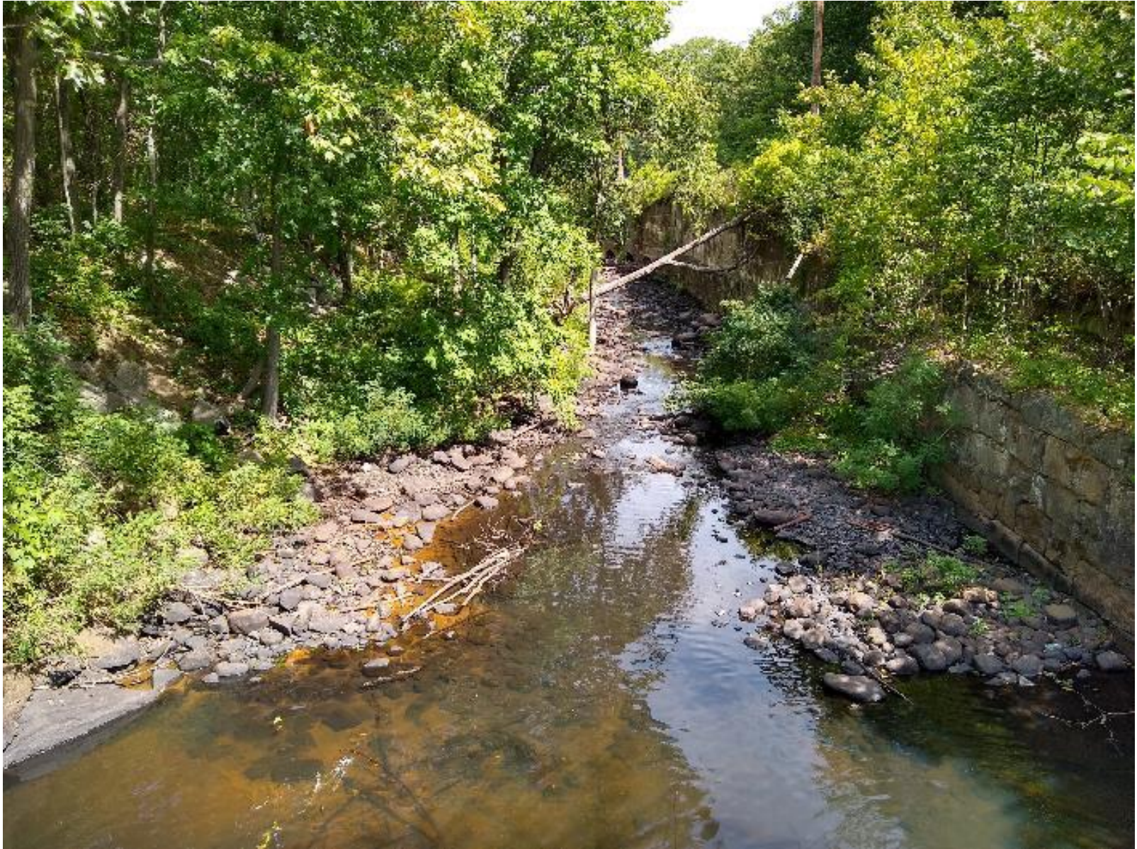
River Merrimack