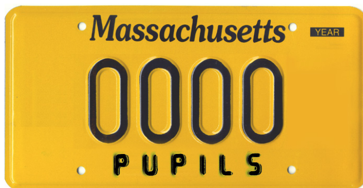
Figure 3: Sample 7D Pupil Plate