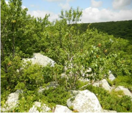
Acidic Rocky Summit with shrubs in cracks, Williamstown.

Description: Acidic Rocky Summit/Rock Outcrop Communities occur on typically dry rocky summits (balds), ridge tops, or rock outcrops with exposed acidic bedrock and little or no soil. Many occurrences are patchy and may be in a mosaic with Ridgetop Pitch Pine - Scrub Oak , Acidic Rock Cliff , and/or Open Talus/Coarse Boulder Communities . Generally the outcrop community is on steep slopes with aspects from SE through SW. Exposed rock outcrops have greater fluctuations in temperature and relative humidity than in adjacent forests.