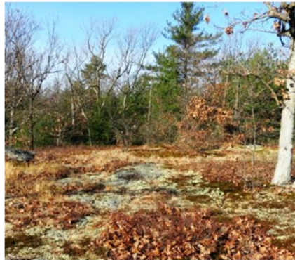
Acidic Rocky Summit lichens on rocks with lowbush blueberry.

sweet and low sweet blueberries, bearberry, black chokecherry, dwarf serviceberry, and occasionally dwarf chestnut oak. Little bluestem, poverty grass, common hair grass, Pennsylvania sedge, and cow wheat regularly grow in acidic outcrop communities with species from surrounding forests. Floristic diversity varies among occurrences due to geology, geography, and the local community structure.