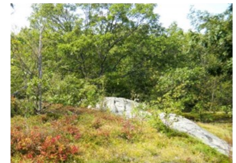
Acidic Rocky Summit/Rock Outcrop.

Examples with Public Access: Mt. Greylock State Reservation, Adams; Watatic Mtn., Ashburnham; Middlesex Fells Reservation, Winchester/Stoneham.