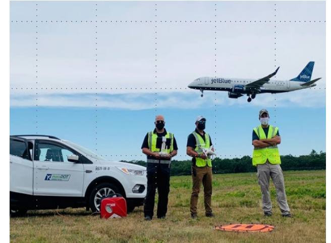
MassDOT Crew Prepares for Drone Mission